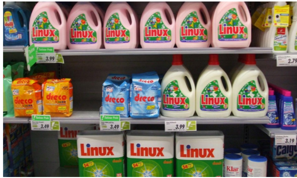
Fig. 3. Wikipedia, a product bearing „Linux“ name, but not infringing the trademark owned by Linus Torvalds, because it falls into a different category.

But if images can be owned, how can we understand their visual boundaries? If the ability to enforce ownership over graphics requires establishing the limit of an idea, how can we do so with fuzzy objects such as images that seem similar? In order to register a logo in the U.S. Patent and Trademark Office, it has to be sufficiently distinct from other registered symbols within a particular business category. The new brand must be deemed “inherently distinctive” and legible enough as its own endeavor as to not confuse consumers about its possible connection with another party, purposely or accidentally. In reverse, there can be similar logos for companies that are dedicated to different things. But, as expected, companies encompass broad operating categories within their structures, covering the widest possible range of legal categories.