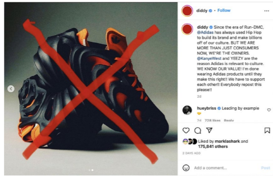
Fig. 5. LOVE (@diddy), "Since the era of Run-DMC @adidas has always used Hip Hop to build its brand and make billions off of our culture. BUT WE ARE MORE THAN JUST CONSUMERS NOW, WE'RE THE OWNERS. @KanyeWest and YEEZY are the reason Adidas is relevant to culture. WE KNOW OUR VALUE! I'm done wearing Adidas products until they make this right! We have to support each other!! Everybody repost this please!!", Instagram.com, September 6, 2022, Photo: Ye (formerly known as Kanye West) accuses Adidas of copying his designs, also manufactured and funded by Adidas, sparking protests by media personalities such as Sean Combs aka Diddy.