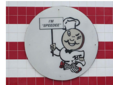
Fig. 2. McDonalds, “Speedee” the anthropomorphic hamburger, the corporate mascot long before the creation of “Ronald McDonald”.

Expanding outward from the single logo as identifier to a graphic system, companies now use branding both to operate internally and to communicate externally. As scientific management took hold of manufacturing in early 20th century America, standardization proved itself to the managerial and owner class. By reducing derivation in the production process, including everything from the parts used to make a good to the movements used to construct it, new levels of efficiency were unlocked. This ethos went hand-in-hand with branding, which through visual language helped businesses to deploy and replicate themselves across the globe.