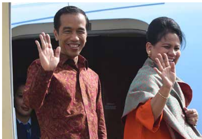
Indonesia's President Joko Widodo and wife Iriana Widodo

vessel as part of the highly publicised assertion of Indonesian control over its fisheries. Indonesia's new fisheries minister Susi Pudjiastuti cancelled a 2013 fisheries MoU with China. Enhanced law enforcement by Indonesian authorities raises the possibility of further confrontations with armed Chinese vessels, which may be harder to de-escalate quietly in the midst of the Indonesian government's high-profile enforcement efforts. 176