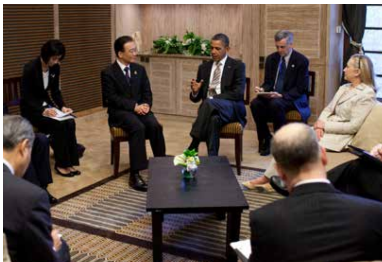
US President Barack Obama met with Chinese Premier Wen Jiabao in Indonesia, November 2011

The strategic landscape facing regional countries like Indonesia is dominated by the rising power of China and the response to that rise. Most observers detect a competitive dynamic in the relationship between the United States and China, even as there is no consensus as to the underlying motives and goals of either country. The position taken by a senior Indonesian foreign policy advisor appears to resonate widely in Jakarta: