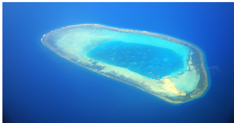
One of the disputed Paracel Islands in the South China Sea

known as the “Haiyang Shiyou 981”, along with a protecting armada of more than 100 fishing and other vessels shocked the region and particularly Vietnam, the other main claimant to these islands in the SCS. Observers point to the incident as a clear indication of China’s provocative and coercive behaviour and of violating Vietnam’s sovereignty, specifically its 200-nautical mile economic exclusive zone (EEZ) and its claimed continental shelf. Vietnam promptly protested the oil rig deployment and confronted the protecting armada with coast guard and fishing fleets, frogmen deploying nets and other obstacles. A Vietnamese foreign ministry briefing in June 2014 reported that 19 official Vietnamese vessels were damaged by Chinese ramming and water cannon attacks, injuring 12 Vietnamese officers. Vietnamese media in late May also highlighted the sinking of a Vietnamese fishing boat after being rammed by a Chinese government ship. On the other side, the Chinese Government claimed that as many as 63 Vietnamese vessels confronted the rig and protecting Chinese boats, ramming Chinese government ships 1416 times since the deployment of its oil rig.