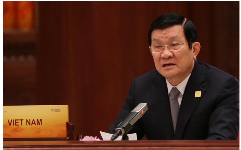
Vietnamese President Trương Tấn Sang

The Joint Vision Statement on Defense Relations, signed during the June 2015 visit to Vietnam by US Secretary of Defense Ashton Carter, foresees a deepening of defence and security ties, including the possibility of increased defence technology cooperation and trade. The visit also marked the first time a US Secretary of Defense toured a Vietnamese military base and inspected a Vietnamese Coast Guard cutter. During President Obama's visit to Vietnam in May 2016, it was announced that the US would sell 18 45-foot patrol boats to Vietnam's coast guard, provide support in establishing a peacekeeping training centre