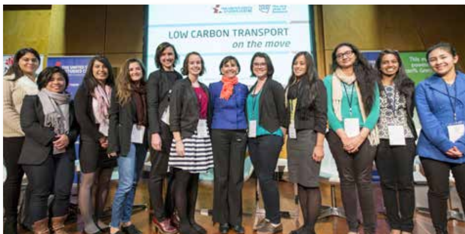
University of NSW and University of Technology, Sydney engineering students