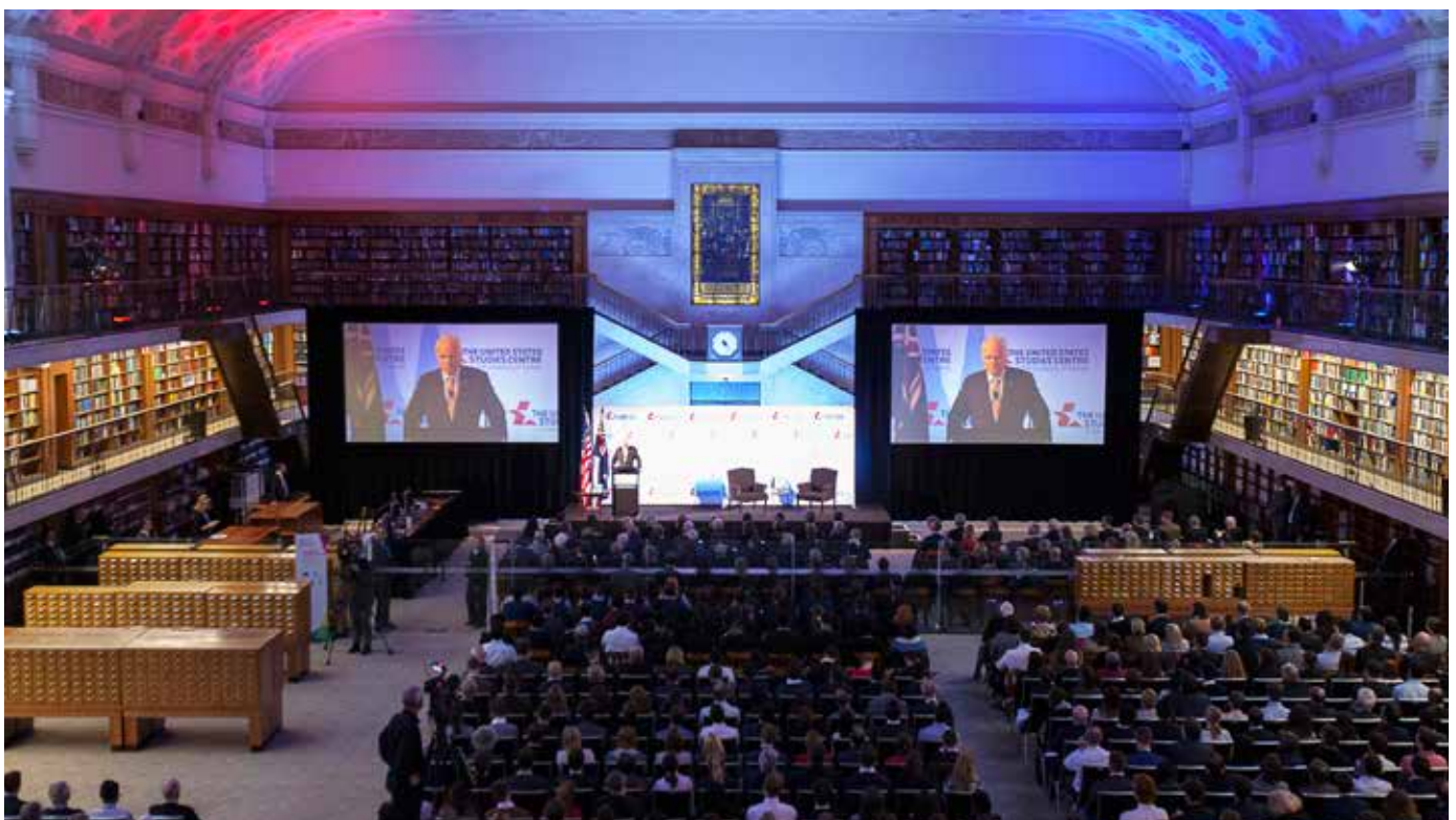
Senator McCain speaks at the State Library of New South Wales in Sydney

To be sure, China has performed an economic miracle — one that not only benefits millions of its own people, but also many Australians and Americans as well. This is why we have promoted China's integration into the