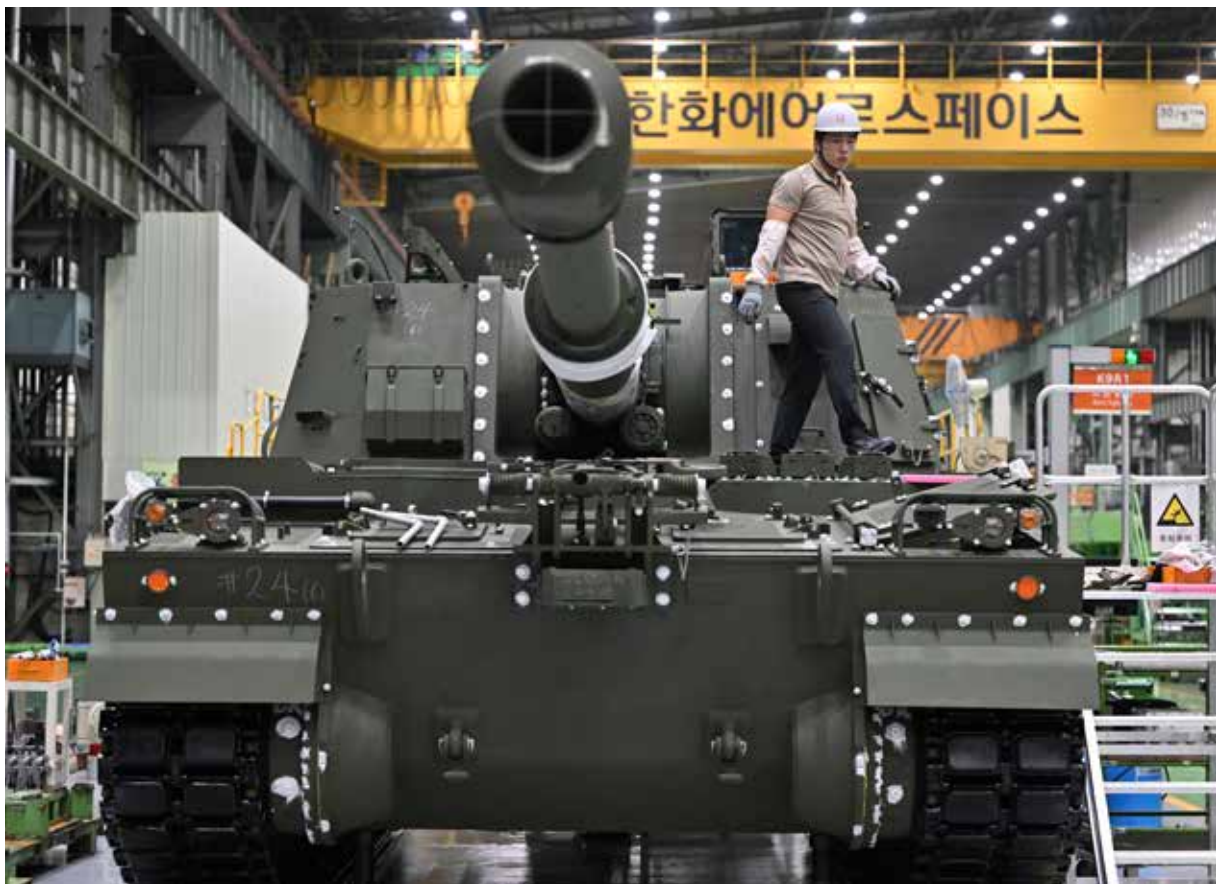
A South Korean engineer works on a K-9 self-propelled howitzer at Hanwha Aerospace factory in Changwon, September 2023.

Beyond commercial shipping, this included spotlighting Korean and Japanese capacity to produce "world class" high-end naval vessels like air warfare destroyers at the fraction of the cost of US equivalents. 216 This shift towards greater collaboration on military shipping has been reflected in recent commercial activity between the two countries. For instance, HD Hyundai Heavy Industries (HD HHI) and Hanwha Ocean, two of Korea's biggest shipbuilders, both applied for Master Ship Repair Agreements (MSRA) and explored targeted partnerships with local US firms for MRO and design work for a range of merchant and military shipping. 217 This ultimately resulted in South Korean defence giant Hanwha securing a controlling stake in Philly Shipyard, a move framed by the company's CEO as an investment in "the national revitalization of U.S. shipyards" and as a pitch for future US Navy shipbuilding contracts. 218