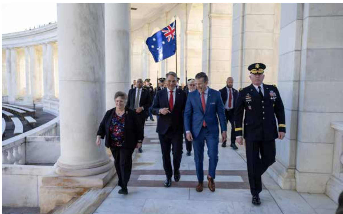
Deputy Prime Minister and Minister for Defence, the Honourable Richard Marles MP, with US Secretary of Defense, Pete Hegseth, at Arlington National Cemetery, Washington DC, February 2025.

Korean defence industry relative to US companies, and historical concerns over technology theft of US military information by South Korean firms, as key impediments to export control reform for Korea and a major reason why US-ROK defence industry and technology cooperation has “lagged significantly behind other US allies.” 272