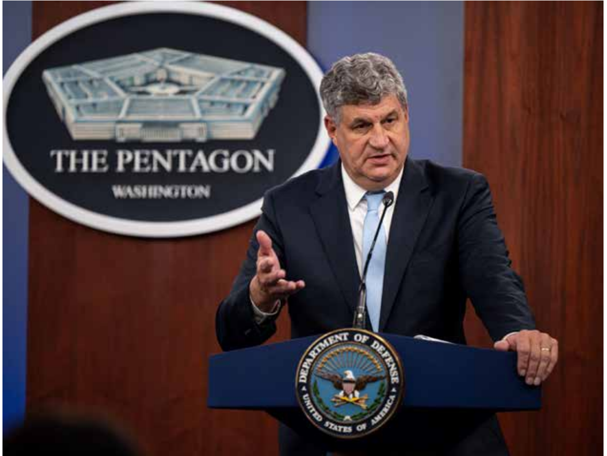
Under Secretary of Defense for Acquisition and Sustainment Bill LaPlante at a press briefing at the Pentagon, September 2022.

Though the Ukraine war has exposed weaknesses within the US defence industrial base, for the Biden and now Trump administration — as well as US allies and partners in Asia — Ukraine has provided sober, albeit useful, lessons about the utility of asymmetric unmanned aerial vehicles (UAVs) in modern warfare, commonly referred to as drones. Over the course of the conflict, UAVs have become ubiquitous, largely because of their cost-effectiveness and ability to elevate “dumb artillery rounds” into more effective weapons. 51 In fact, there is evidence to suggest the fielding of drones en masse supports enhances air defence against Russian missile strikes. 52 This dynamic may bear some wisdom for Taiwan and those with an interest in deterring a Chinese attack over the Taiwan Strait. Though it is highly unlikely UAVs would be sufficient on their own to deter a Chinese attack, officials such as Admiral Pap-