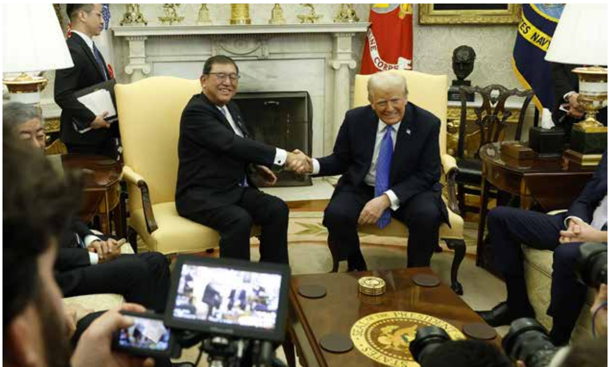
Japan's Prime Minister Shigeru Ishiba and US President Donald Trump at a meeting at the White House, February 2025.

has suggested that recent export control reforms between the four countries should prompt renewed efforts either to reconstitute the NTIB coordination mechanism or to create "a similar mechanism under AUKUS, focussed on a wider suite of ecosystemic industrial and supply chain security requirements" required to overcome lingering barriers to greater defence technology co-development and co-production. 382 A strong case could be made that similar arrangements should also be considered for other minilateral defence industrial initiatives. For example, PIPIR should seek to build on the 2024 Core Vision Statement issued at its inaugural plenary meeting to identify at least two viable cross-cutting issues — for instance, cybersecurity and supply chain de-risking — for prioritisation across its four workstreams (sustainment, production, supply chain resilience, and policy and optimisation), including the creation of a mooted "standing industrial advisory board" as quickly as possible. 383