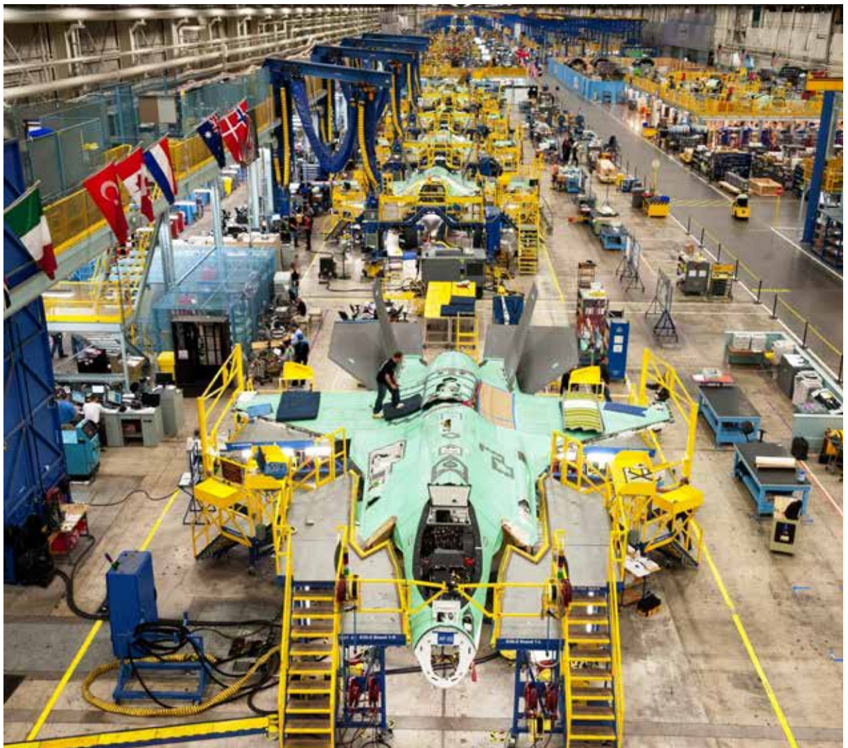
An F-35 Joint Strike Fighter production line.