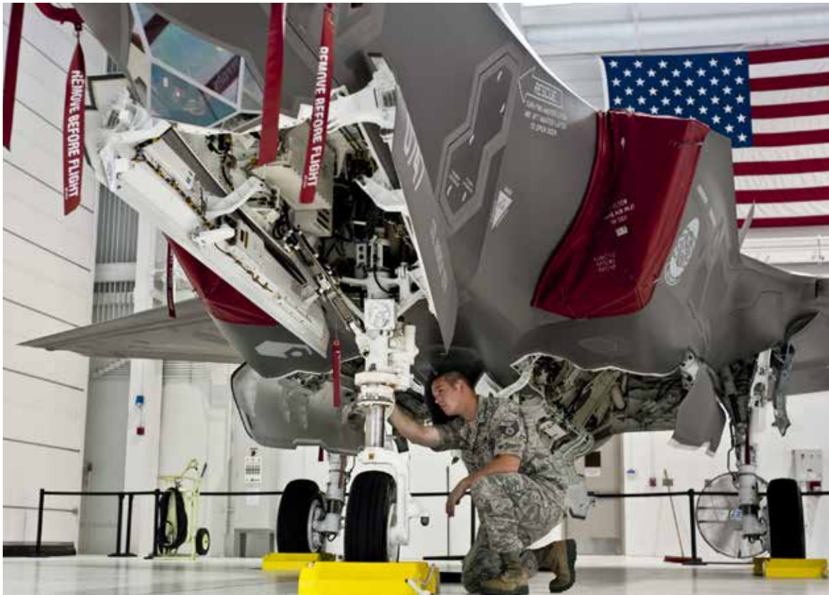
Staff Sergeant Michael Sanders of the 58th Aircraft Maintenance Squadron checks out an F-35A Joint Strike Fighter at Eglin Air Force Base, Florida.

this year and 2-3 year delays for the most up-to-date models of Virginia-class submarines. 99 While the Pentagon is proceeding with both programs under a '2+1' production schedule — 2 SSN and 1 SSBN per year — senior Navy officials have repeatedly stressed that the Columbia-class remains the Navy's singular top acquisition program, meaning that it would receive priority when it comes to allocating industrial or workforce resources relative to the Virginia-class program. 100 Indeed, a GAO January 2023 report noted that the priority status afforded to the Columbia-class program, and the tight window for seamlessly replacing the US Navy's existing SSBN fleet, had already resulted in shipbuilding staff originally assigned to Virginia-class construction being re-tasked, contributing to delays for that program. It also noted that long-term planning for both programs did not account for these sorts of shared risks "that are likely to present production challenges and could result in additional costs." 101