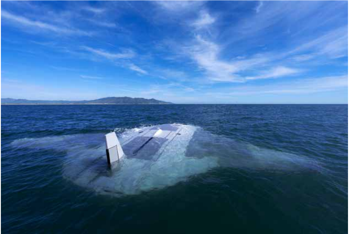
The Extra Large autonomous underwater vehicle 'Manta Ray', developed by the US Defense Advanced Research Projects Agency (DARPA) and Northrop Grumman.