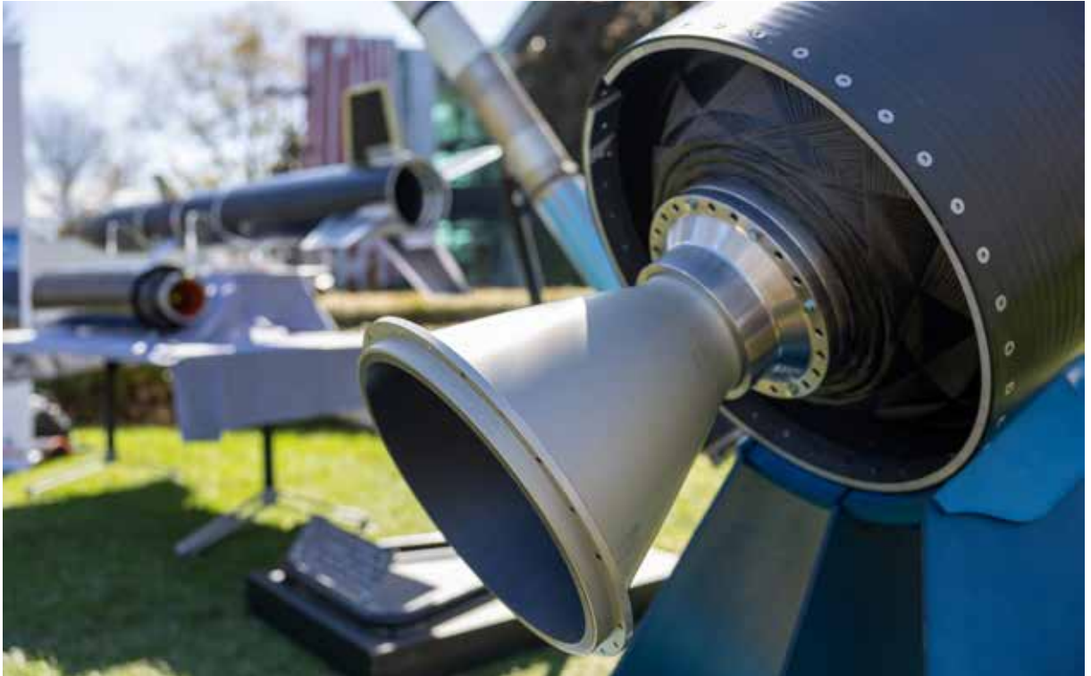
The Albanese Government has agreed to build solid rocket motors in Australia, as part of its commitment to rapidly establish domestic manufacturing of Guided Weapons and Explosive Ordnance (GWEO).

Technology sharing and co-development efforts have also progressed through Pillar II. These activities have focussed largely on improving the interoperability and interchangeability of existing advanced capabilities operated by all three countries, many of which have had distinct maritime domain applications. 137 In 2024, for instance, the AUKUS partners deployed common advanced artificial intelligence (AI) algorithms on their respective P-8A Maritime Patrol Aircraft, enabling more rapid data processing, information-sharing and target identification in “congested acoustic environments.” 138 Relatedly, the three countries have sought to “scale up” the integration of torpedo-launched unmanned system capabilities onto current UK and US (and future Australian) submarines, integrating UK Sting Ray lightweight torpedoes onto P-8A alongside standard US Mk 54 variants to enhance interchangeability, and testing quantum clocks for maritime position, navigation and timing purposes. 139 Elsewhere, the AUKUS partners conducted several artificial intelligence (AI) and autonomy demonstrations, with the intention of supporting better decision-making