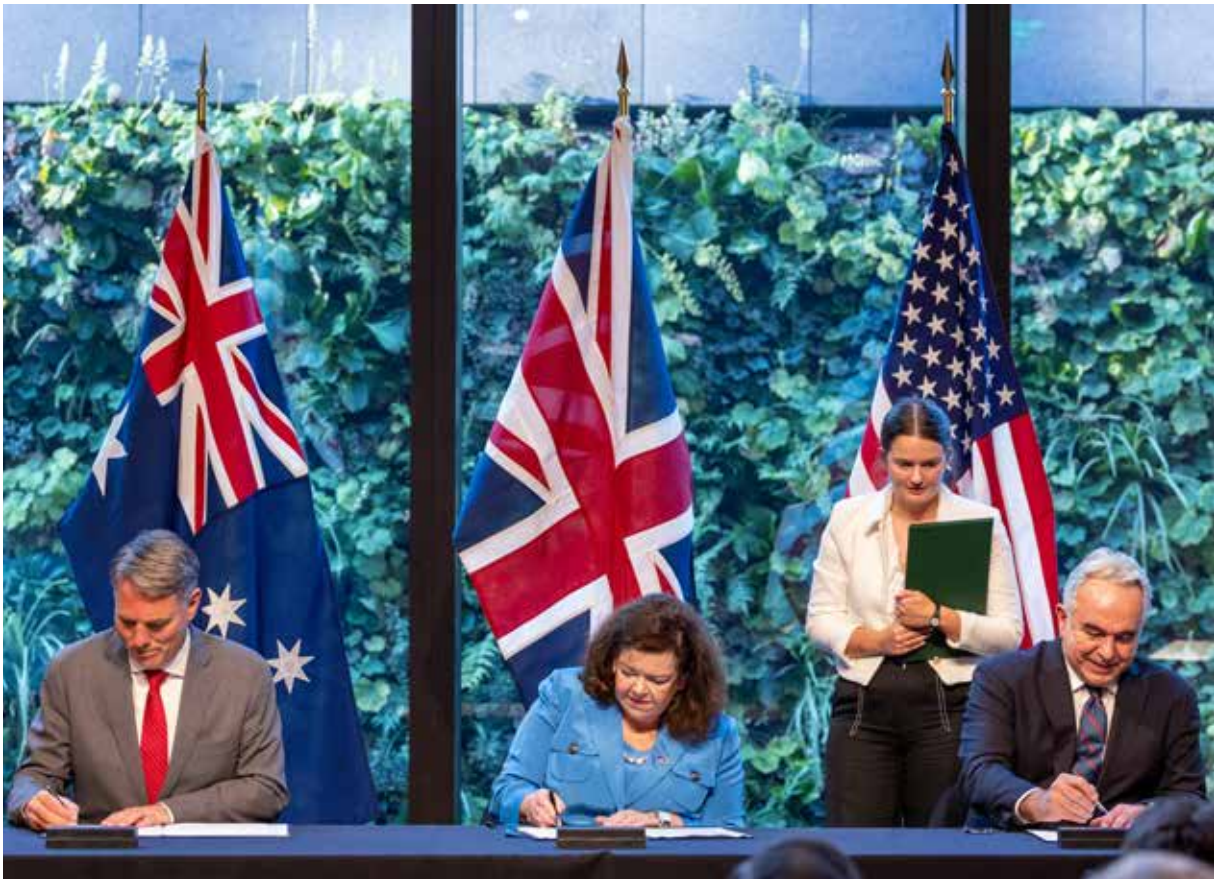
The Deputy Prime Minister and Minister for Defence, the Honourable Richard Marles MP, British Ambassador to the United States, Dame Karen Pierce, and US Deputy Secretary of State, Kurt Campbell, sign the AUKUS Agreement for Cooperation Related to Naval Nuclear Propulsion in Washington DC, August 2024.

recommending that all countries considered in this report should ‘spend more money’ or ‘deepen their engagements’ would hardly constitute an original take. Instead, this report offers several broad recommendations for the Trump administration and its partners in Canberra, New Delhi, Seoul and Tokyo to consider as they seek to build out a federated defence industrial agenda in the Indo-Pacific. Priority areas for work include institutionalising new information-sharing practices; deepening industry engagement; collective mapping and simulation activities; coordinated defence industrial security measures; and maximising government efficiencies in defence acquisition and trade.