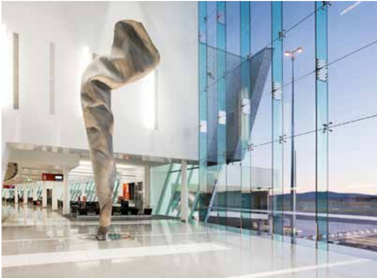
Canberra Airport

to double between 2012 and 2025. 157 Sydney Airport (SYD) as the country's main gateway, is constrained. This provides incentive for dedicated freight facilities in the new Western Sydney Airport city. As land prices continue to rise in eastern Sydney, the appeal of inland logistics hubs should support the momentum for major freight operations to gravitate further west.