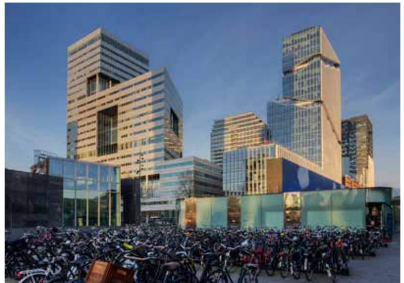
Zuidas business district near Amsterdam Airport Schiphol

As Australia embarks on its first publicly-funded airport project in more than three decades, there are lessons and insights to be taken from the US experiences of airport cities. Some may have been accidental and others exceeded expectations, but this paper highlights some of the elements of their success.