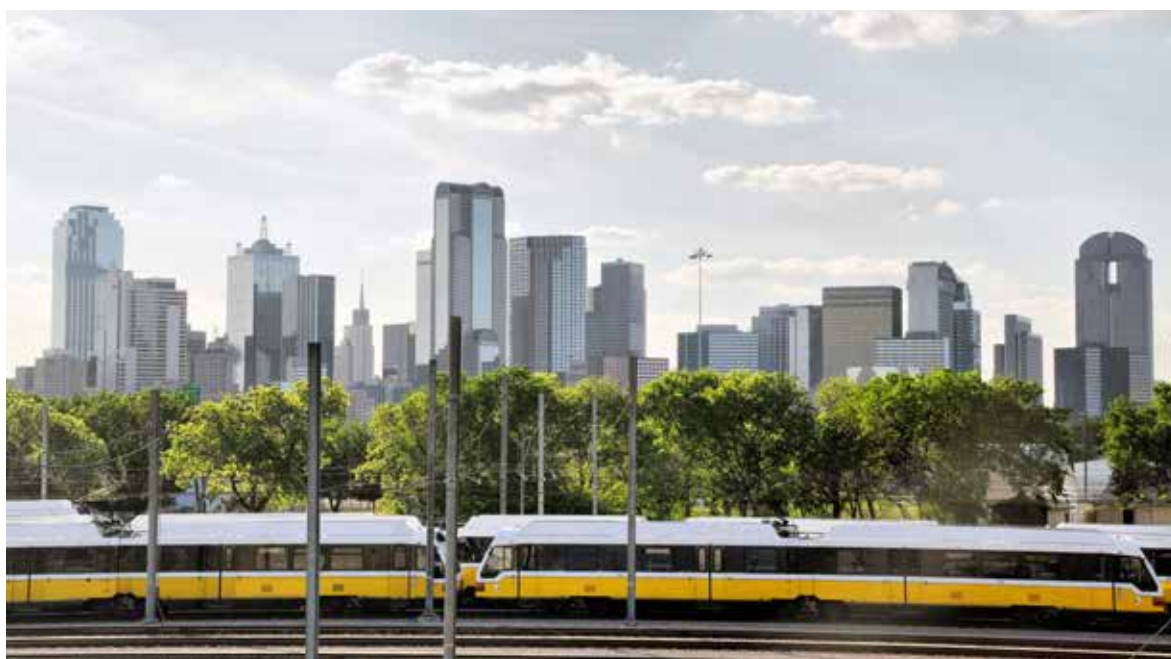
Dallas Area Rapid Transit trains

In the United States, the real estate surrounding an airport is often — although not exclusively — owned by the airport operator, often a state or municipal government entity. In many cases, this gives government an unprecedented hand in urban use planning and economic development. Take Dallas/Fort Worth International Airport (DFW) in Texas. It is one of the most advanced when it comes to filling the land around the airport with offices. As a greenfield site, DFW had some 25 square kilometres (6,000 acres) of land available for commercial development. 87 Furthermore, the economic development zone of Las Colinas, just east of the airport, is now a central business district in and of itself, with the headquarters of nine Fortune 1000 companies.