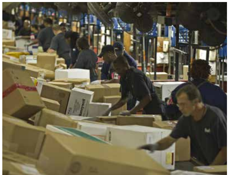
Inside the FedEx Memphis, Tennessee, Headquarters and World Hub

As FedEx invests in facilities around the world (its largest hub is now in Hong Kong), current Tennessee governor, Bill Haslam, makes sure the company doesn't feel taken for granted. At a recent ceremony to announce a further US$1 billion modernisation of its global headquarters at Memphis airport (the FedEx Memphis World Hub), Haslam said the industry had totally transformed the city over the past 40 years. The city's former claim to fame, Elvis Presley, died just as the company was setting up shop.