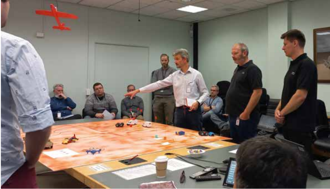
Personnel from Australia, the United States and the United Kingdom live tested autonomous ground vehicles in a contested electronic warfare environment in South Australia in late 2023.

One other state-supported body that deserves attention is the Advanced Research and Invention Agency (ARIA), a UK Government R&D funding agency established by statute in 2022. Its mandate is to fund high-risk, high-reward, speculative or underexplored areas of science and technology, which conventional funders — including the existing government bodies — often avoid because of risk, long timelines or interdisciplinarity. ARIA is sponsored by the Department for Science, Innovation and Technology, although it is independent in its decision-making, and has an initial funding scope of around £800 million for its first five years. 34 ARIA's mission is considerably broader than defence, and spans civil, environmental and health applications, amongst others. ARIA does not appear to have been involved in any official capacity in the AUKUS Pillar II endeavour thus far; however, its focus on general-purpose technologies such as quantum, AI and robotics means some of its outputs could indeed be applicable to AUKUS in the future. It is a youthful institution compared to many of the other government-led bodies, and ample opportunity remains to further define and advance its purview.