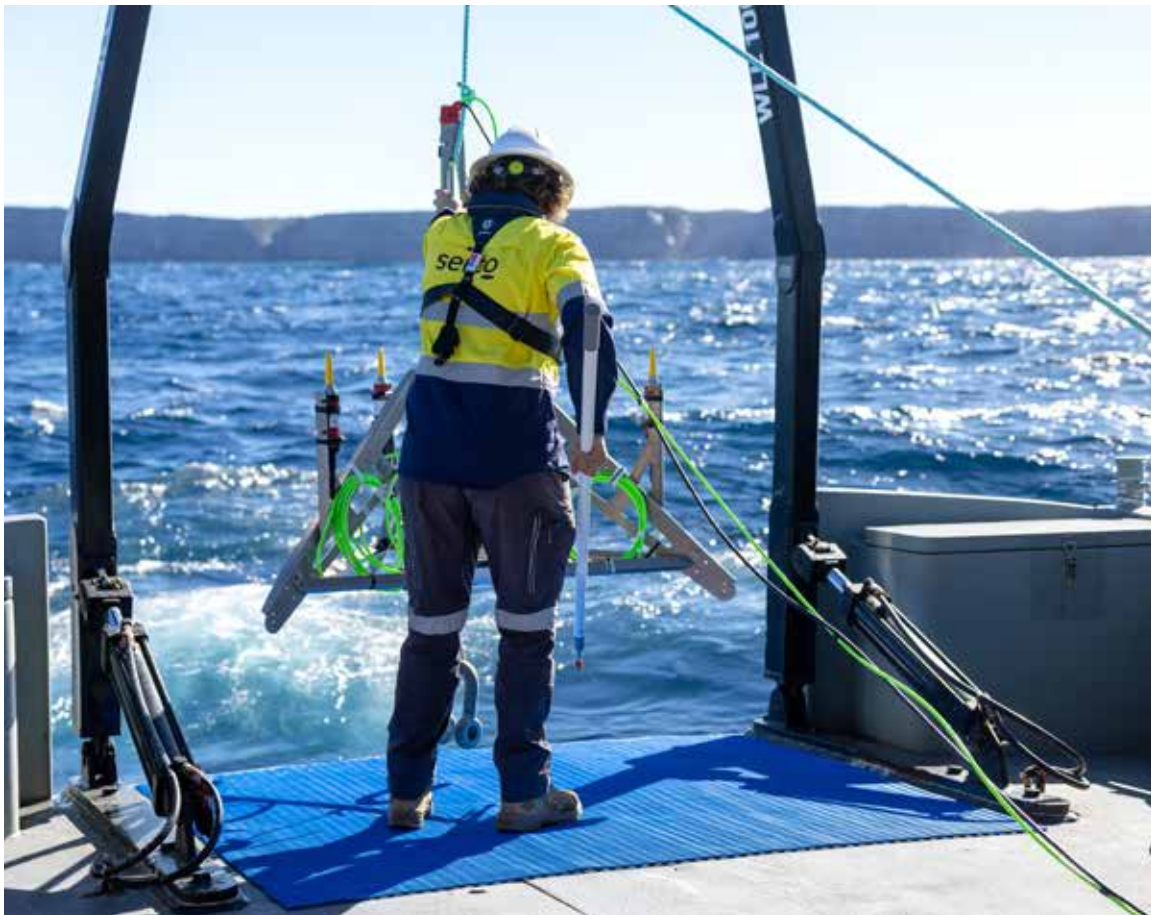
Under AUKUS Pillar II's Maritime Big Play series, Australia, the United Kingdom and the United States tested their autonomous systems underwater at Exercise Talisman Sabre 25.

of the inaugural AUKUS Electronic Warfare Innovation Challenge, and universities remain eligible participants for other active challenges being led by DASA. 19 Universities have also contributed to the public debate and scrutiny around AUKUS, including making submissions to the House of Commons Defence Committee's AUKUS Inquiry, arguing that universities should be given greater direction within Pillar II delivery. 20 UK universities have been involved in several trilateral higher education frameworks, most notably King's College London's role as the UK anchor of the Security & Defence PLuS initiative, a global partnership advancing security, defence innovation and policy across partner universities in the United Kingdom, the United States and Australia. While it predates AUKUS, it has been strengthened to focus more specifically on the pact and its opportunities. 21 Overall, universities' enthusiasm for AUKUS has not been met by significant engagement from the UK Government, and there are considerable barriers to the fulsome and effective participation of UK universities within AUKUS Pillar II, which will need to be overcome.