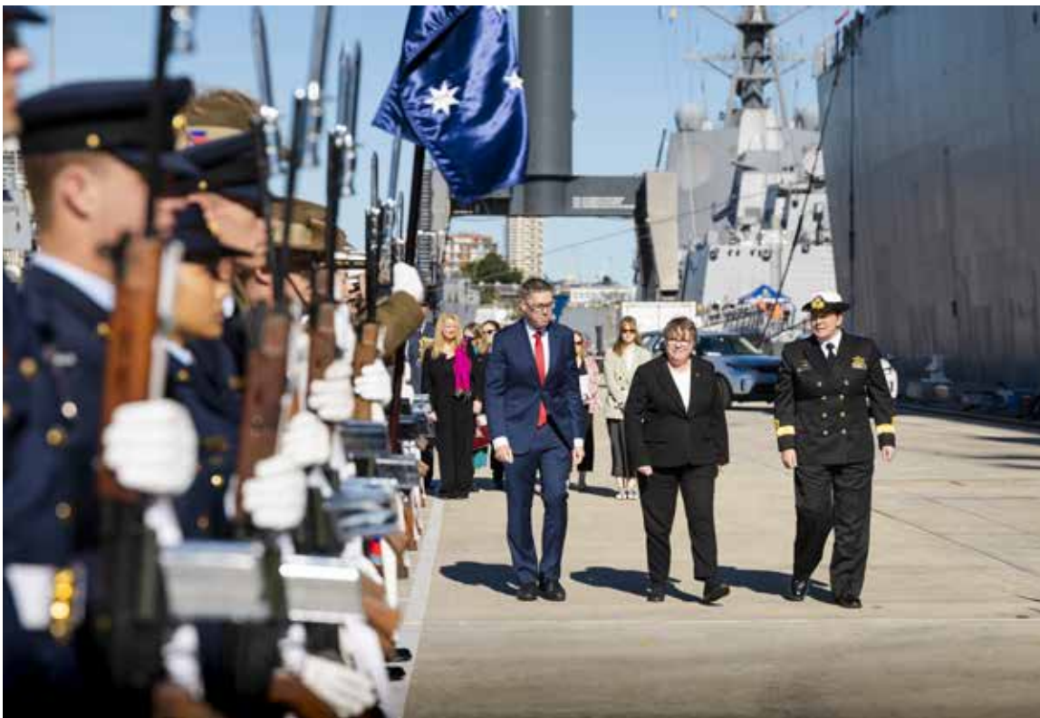
Australia's Minister for Defence Industry Pat Conroy and UK Minister for Defence Procurement and Industry Maria Eagle met at Fleet Base East, Sydney in May 2025.

The final, and most important, major constraint on the UK R&D ecosystem is found in funding limitations . Industry partners rely on slow and fragmented MoD procurement cycles, which also disincentivise the risk-taking needed to support the growth of emerging technologies. 49 For SMEs and start-ups, their early-stage innovation grants from bodies such as DASA may support sustainment, but are insufficient to achieve the scale needed for research commercialisation and deployment. Catapults are effective translational institutes, but face periodic funding reviews, which can undermine long-term planning and commercial certainty. 50 Funding challenges across all three of these areas fundamentally impede progress on every other constraint, and it is therefore imperative for the UK Government to explore how to provide the necessary scale, certainty and consistency required for all components of the United Kingdom's R&D ecosystem to fulfil their potential towards this AUKUS national mission.