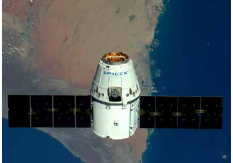
The SpaceX Dragon spacecraft seen from the International Space Station, 2016

The space sector is experiencing a period of rapid change. New actors, new industries and new technologies are changing the way space is accessed and used. As Australia looks to take advantage of this change and develop its own civil space program, its closest ally and the globe's preeminent space power is looking for allies to share the space burden and become more space capable themselves. To maximise the value from the US-Australia space relationship, Australia should ensure that its civil and national security space communities can work closely together, consider projects that will help build-out Australia's domestic space industry and align where possible with US strategic goals. Working with US industry and the government-led space sector will assist Australia to strengthen its burgeoning civil and national security space sectors.