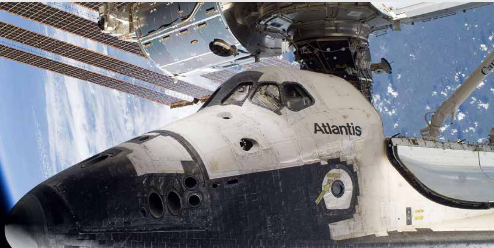
NASA space shuttle Atlantis docked to the International Space Station, 2010

Space situational awareness ("SSA") refers to global networks of ground and space-based sensors that track where space objects are. Used in a national security context to track foreign satellites, and in a civilian context to predict and avoid collisions with active satellites and orbiting debris ('space junk'). Australia hosts space situational awareness sensors at its Joint Defence Facilities with the United States, and also in civilian settings. 27