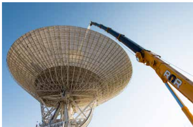
A crane positions NASA’s L-band radio receiver cone at Canberra Deep Space Communication Complex

Across these different centres of capability some consistent threads of niche expertise stand out. Leveraging its advantageous geographic position, 34 Australia has developed national strengths in ground communication facilities like the Deep Space Communications Complex near Canberra 35 and in the emerging field of space situational awareness, exemplified by the debris tracking facility run by Electro Optic Systems. 36 Australia’s large land area