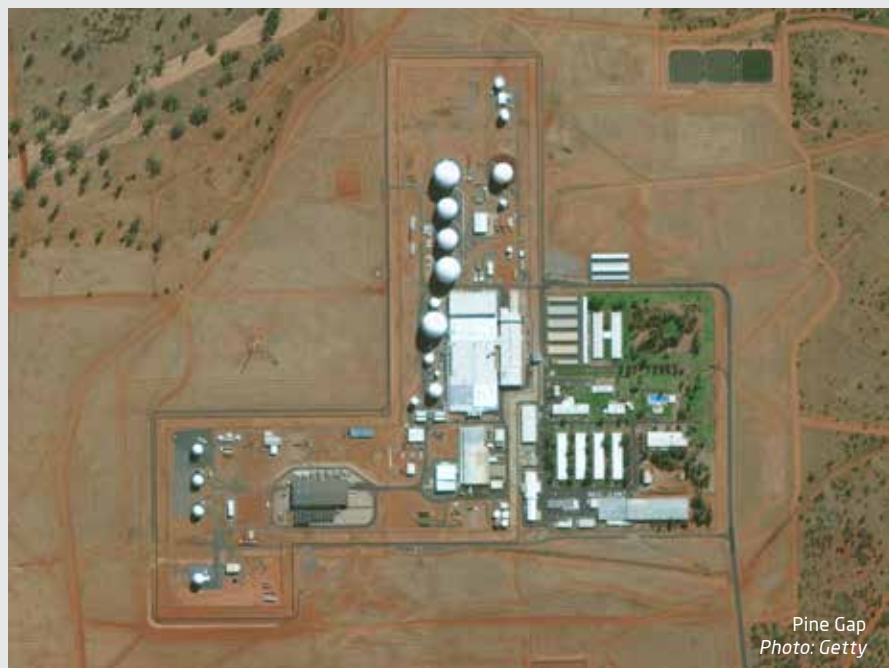
Pine Gap

These government-to-government arrangements do not stand alone. There is substantial ongoing cooperation in industry and academia. For example, US entities participate in cooperative research efforts, like the Space Environment Research Centre, where Lockheed Martin and the University of Arizona are key collaborators. The University of Queensland Centre for Hypersonics partners with Boeing, Caltech and NASA. The Australian Centre for Astrobiology at the University of New South Wales has strong links with NASA and is one of only two Associate Members of the NASA Astrobiology Institute globally. 100