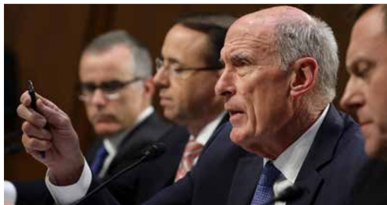
Director of US National Intelligence Daniel Coats

For a country that has previously resisted the need to rely on allies in space, this is a striking development.