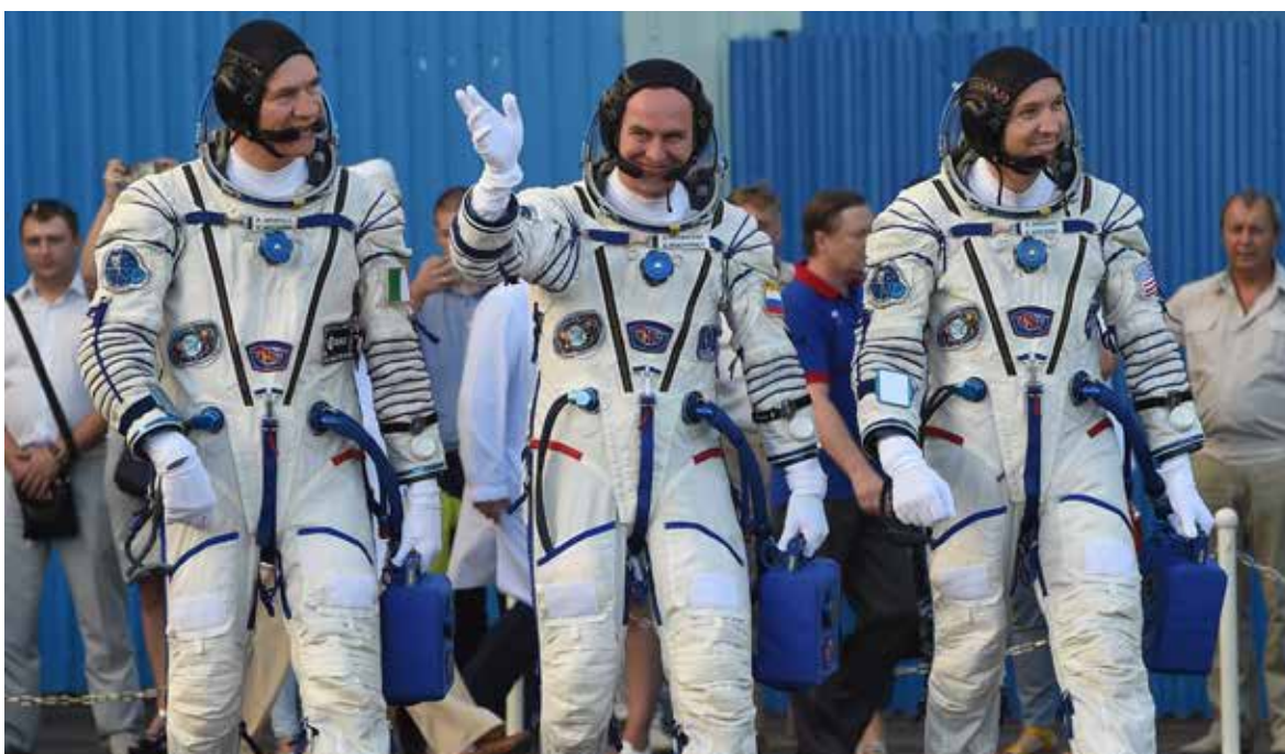
L-R: ESA astronaut Paolo Nespoli, Russian cosmonaut commander Sergei Ryazansky, NASA astronaut Randy Bresnik

sharing between the United States and China on issues like space object tracking is critical to a safe space environment, and channels for sharing this information are limited but improving. 111 One role for an Australian space agency could be to act as an intermediary in holding and disseminating this data in an open and transparent way. 112 More controversially, some in the United States civil space program would like to do more with Beijing in scientific space exploration, given that China is one of the few countries with funds for space exploration and a willingness to invest. 113 Former NASA Administrator Charlie Bolden made efforts early in his term to engage China, 114 but Congress has imposed broad restrictions on US entities working with China on space projects. 115 This may be a missed opportunity. Even at the height of the Cold War there was symbolic space cooperation between the United States and the Soviet Union, such as the joint Apollo-Soyuz mission, 116 that sought to foster trust and people-to-people links. Although recent shifts in US national security and defence strategy will present challenges, 117 Australia could engage the United States and China in a way that would be valuable to all three nations, provided that Australia develops the space credibility to be a respected intermediary.