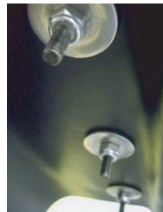
figure C inside