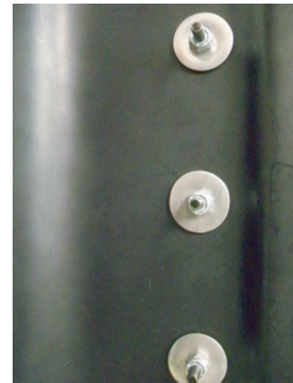
figure B inside