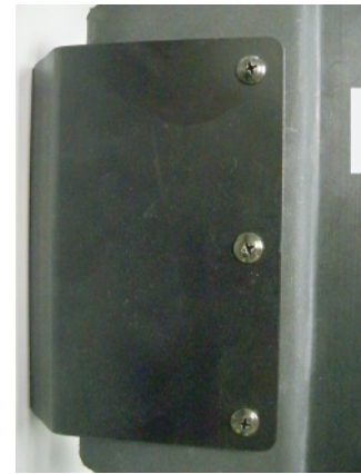
figure A outside

Using figures A, B and C as examples, insert screws from the outside of the case, and gasket seal washer and nylon lock nut from the inside of the case. Use wrench & screwdriver to tighten the screws.