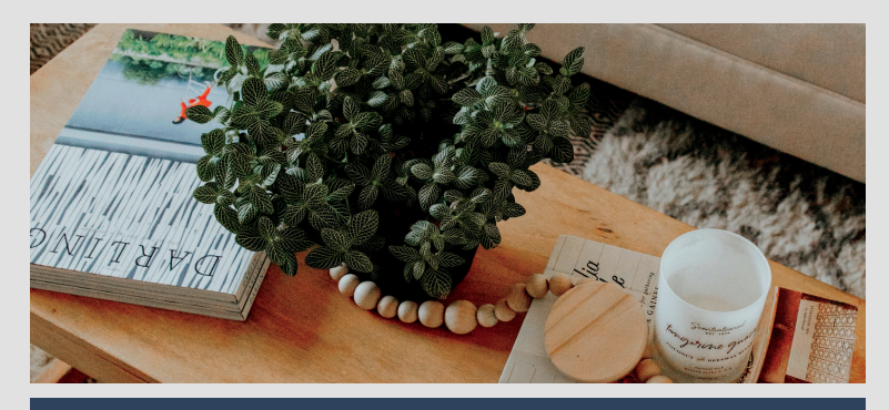
CLOSING DAY REFERS TO THE DAY THAT FINALIZES YOUR PURCHASE. AT CLOSING, FUNDS AND DOCUMENTS ARE EXCHANGED TO TRANSFER OWNERSHIP TO THE BUYER. AFTER CLOSING, YOU WILL RECEIVE ANY REMAINING FUNDS FROM THE SALE OF YOUR PROPERTY.