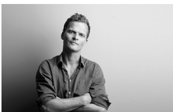
Design Andreas Engesvik

A generous and versatile sofa system with the same confident attitude as the rest of the Gather series. The slender steel legs give the spacious modules a light and almost hovering expression, while the characteristic seam defines the silhouette and reinforces the sense of presence.