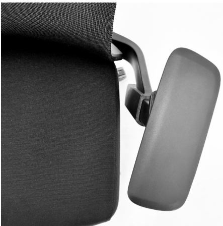
Armrest – Adjustable The chair is supplied with armrests that may be adjusted in depth, lateral, angel and height.