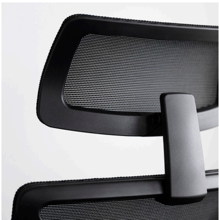
Headrest – Adjustable Eve is available with an optional headrest to relieve and provide comfort to the neck.