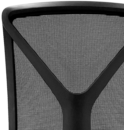
Y-structure The distinctive Y-structure, combined with a sophisticated mechanism for great ergonomics.