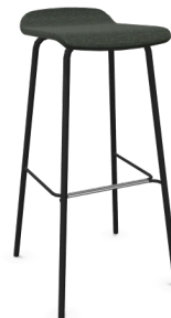
Large, Seat height 800 mm