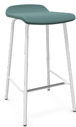
Medium, Seat height 650 mm