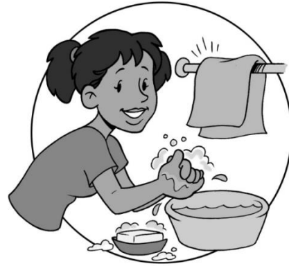
Handwashing with soap

This fact sheet describes the history of soap, what is soap, how it's made, and two processes to make soap. Soap is a necessary item for good hygiene. Teaching people how to make soap can be a good addition to any water, sanitation and hygiene (WASH) project. Ingredients for making soap can be found almost anywhere and the process is simple. Making homemade soap allows people to make soap that suits their needs and preferences and can also be a business opportunity for local entrepreneurs.