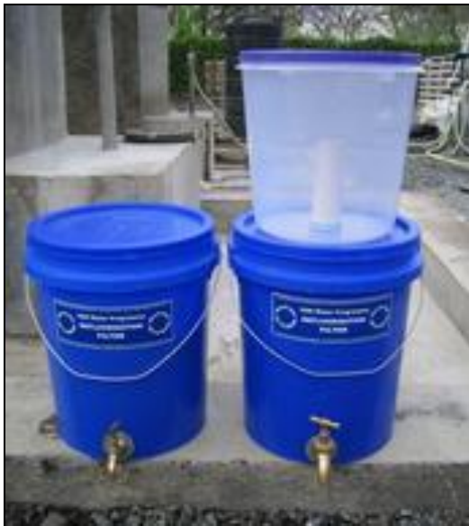
Single and Combined Bone Char Filter

The water level in the filter should never drop below the top of the bone char. If the bone char is left dry, its adsorption capacity will decrease. The water should be in contact with the bone char for a minimum of 20 minutes. The filter can be combined with a ceramic candle to remove microbiological contamination as well (see picture). For new filters or after changing the media, the first few containers of treated water should be discarded due to high turbidity and colour (CDN, 2006).