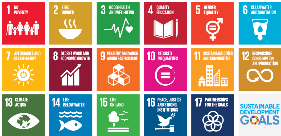
Sustainable Development Goals (United Nations, 2016)

Goal 6 of the SDGs focuses on water and sanitation. Target 6.1 aims to achieve “universal and equitable access to safe and affordable drinking water for all” by 2030. This target and the indicators used to measure it go beyond the MDG target and indicators in several ways: