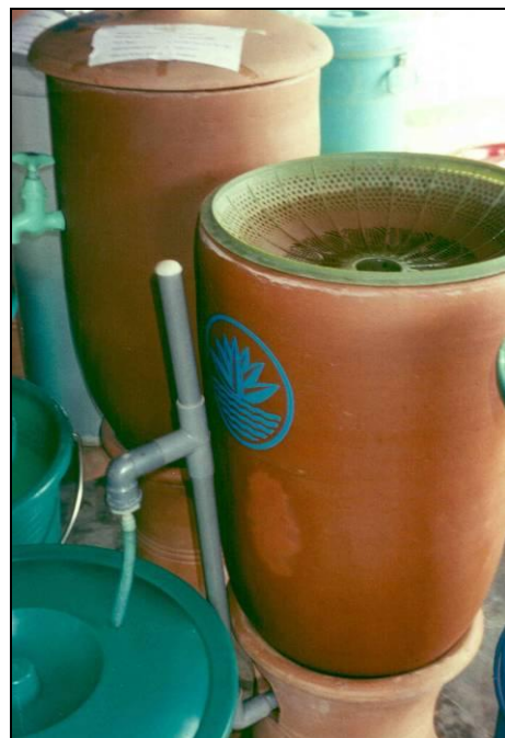
Shapla Filter

The used brick chips are non-toxic and can be disposed of safely without danger to the environment or human health as the arsenic is attached strongly to the iron. The earthen filter container is re-useable and easily maintained.