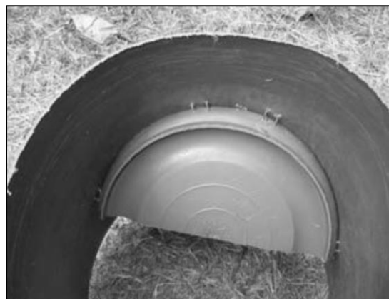
Step 3. Connect one half of the base half way up the bucket using wire. The base should be at an angle so that it will collect urine.