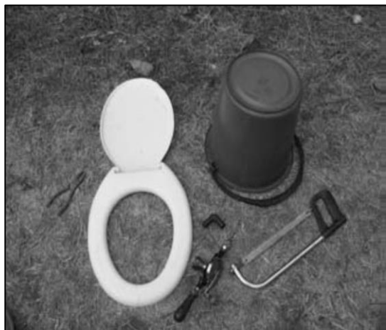
Materials needed for construction.