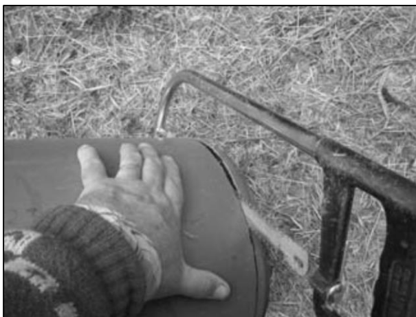
Step 1. Cut the base of the bucket.