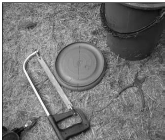
Step 2. Cut the base in half.