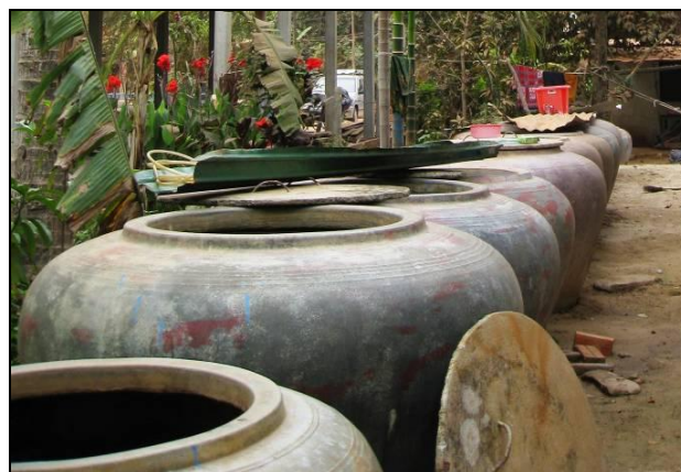
Passive Oxidation in locally available water jars