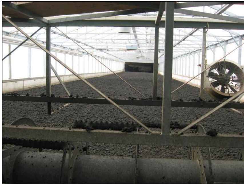
A thermal dryer used for drying wastewater sludge before combustion in Switzerland