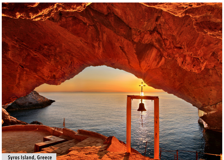
Syros Island, Greece