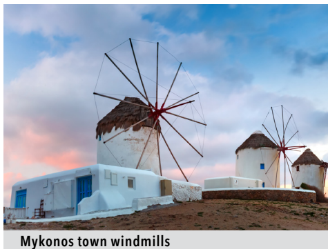
Mykonos town windmills