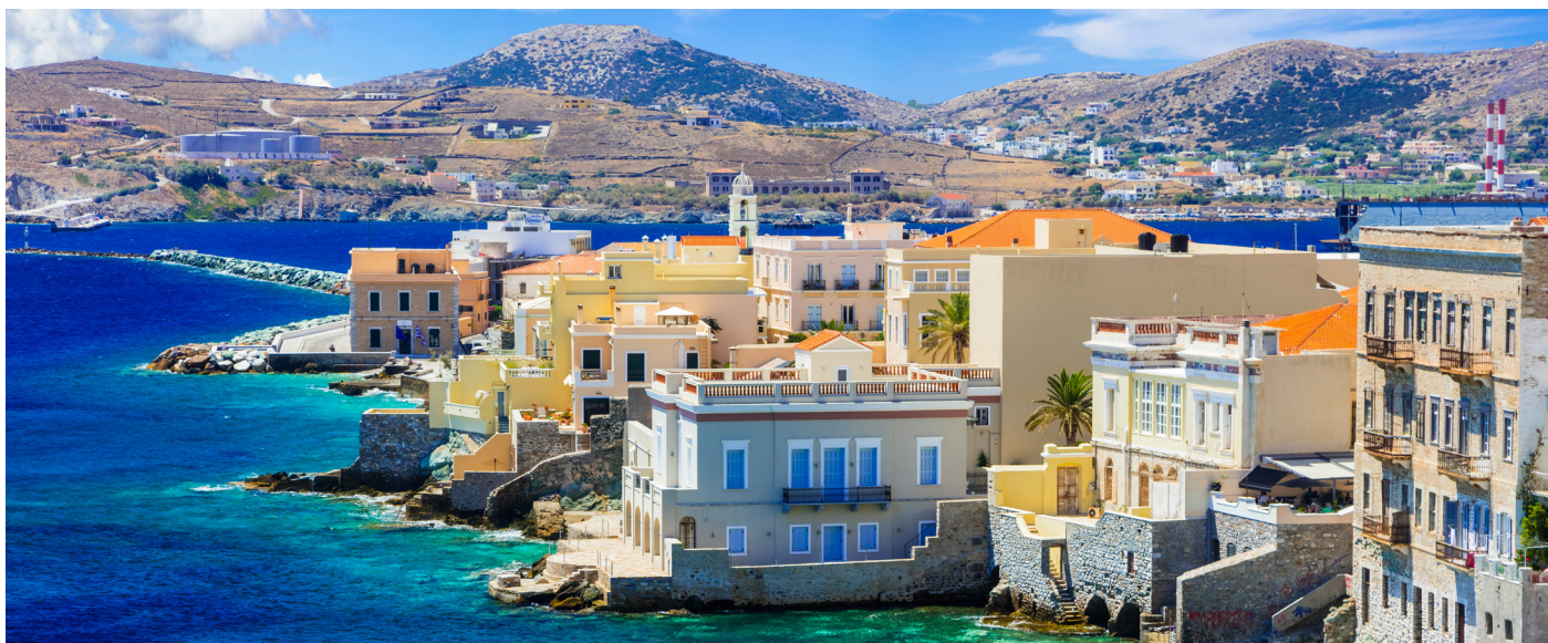
Heraklion harbour with old Venetian Fort Koule, Crete, Greece

Silversea is delighted to announce its return to service from 18 th June 2021. Be among the first to enjoy our new voyages on one of the most spacious ships in our fleet. Sail the beautiful Greek islands on bespoke itineraries that offer the best of a region, aboard our newest flagship Silver Moon . Plus, with two alternative sailing routes, each visiting different destinations, you have the option to combine voyages for extended exploration. From sun kissed beaches to UNESCO World Heritage Sites, we have conceived this collection of cruises with all safety measures in mind. Get back to the discovering the authentic beauty of the world in unwavering confidence.