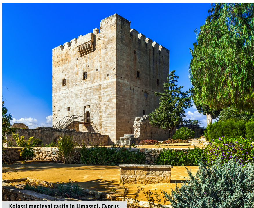
Kolossi medieval castle in Limassol, Cyprus