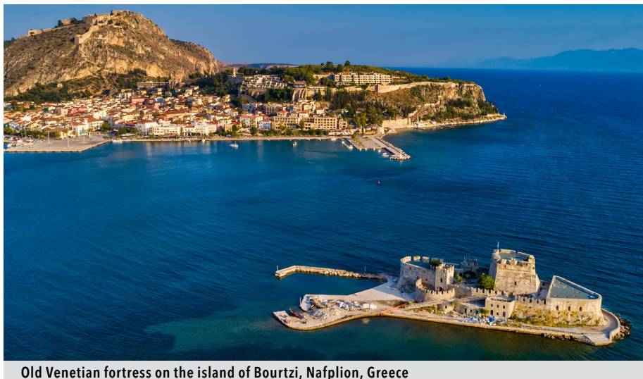
Old Venetian fortress on the island of Bourtzi, Nafplion, Greece