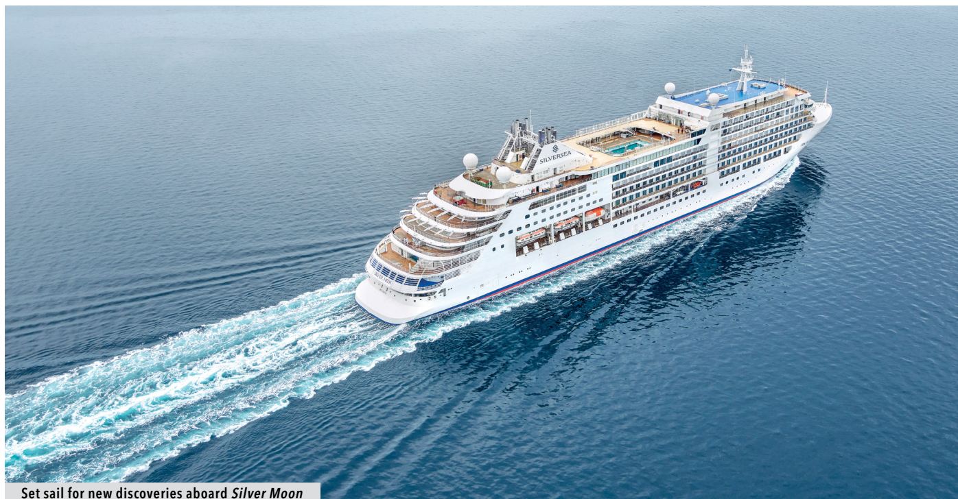
Set sail for new discoveries aboard Silver Moon

We have chosen our newest flagship Silver Moon to kick off this season of sailing in the Mediterranean. Offering an abundance of space, yet maintaining the famous Silversea small-ship intimacy, Silver Moon is the ideal ship to begin cruising again. With eight dining options including the lauded S.A.L.T culinary programme, fewer than 300 suites, an almost 1:1 crew to guest ratio and spacious outdoor areas, the all-inclusive Silver Moon gives ultra-luxury options while making sure that your safety is guaranteed.