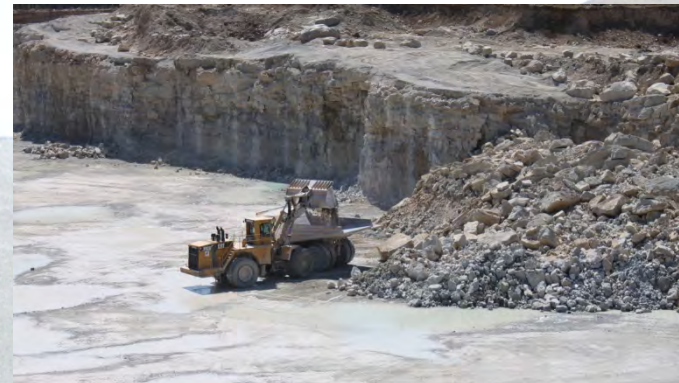
Quarry – Consolidated material extracted (i.e limestone)