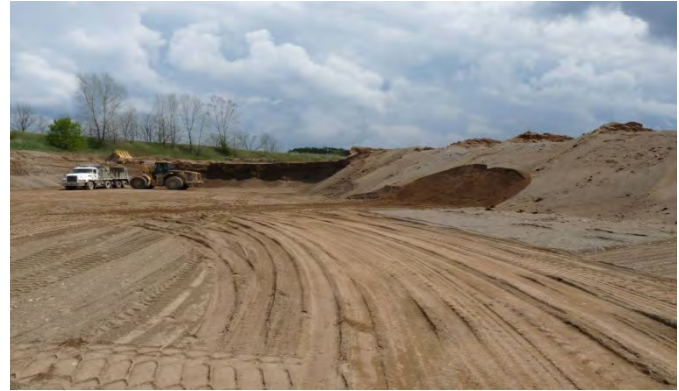
Pit - Unconsolidated material extracted (i.e. sand & gravel)