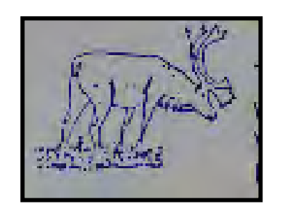
North Caribou Lake