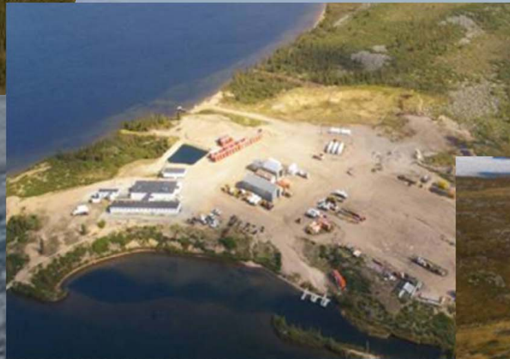
Lockhart Lake Rest and Maintenance Camp (km 170)