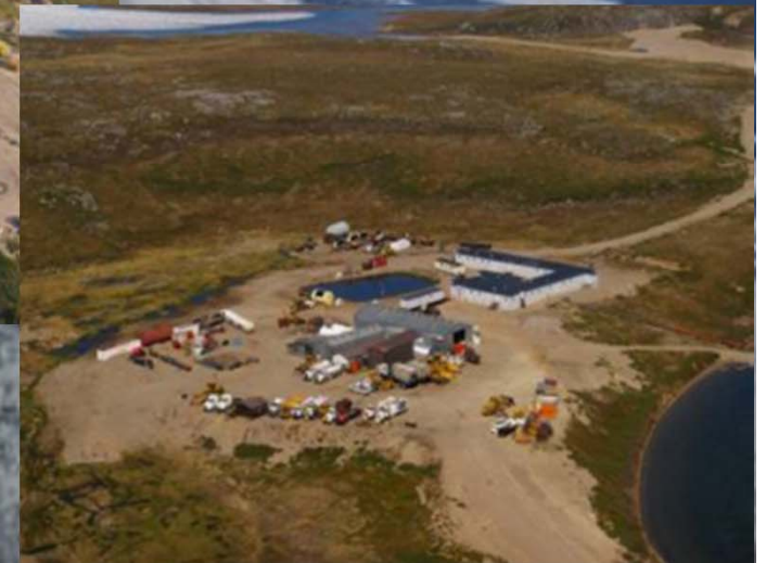
Lac de Gras Maintenance Camp (km 350)