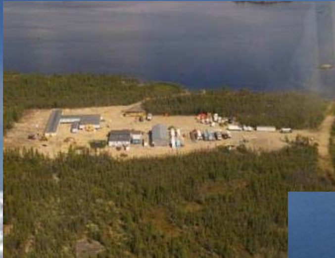
Dome Lake Maintenance Camp (km 35)