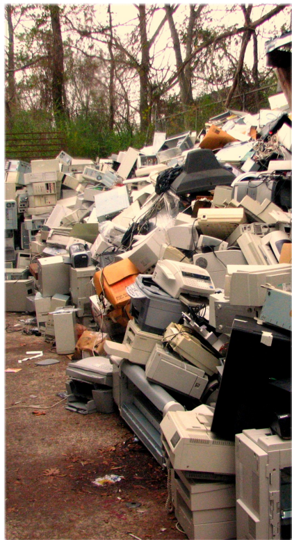
Image credit: Curtis Palmer, via Flickr Original image has been cropped

In order to become an e-waste collection site, contact OES at: