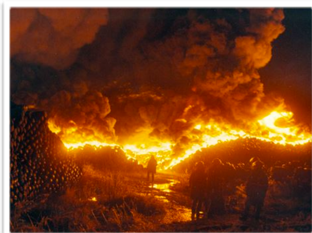
Hagersville 17-day Fire, 1990, therecord.com

“OTS works with our network of Ontario Stewards, Collectors, Haulers, Processors and innovative Recycled Product Manufacturers to ensure a more sustainable future.”