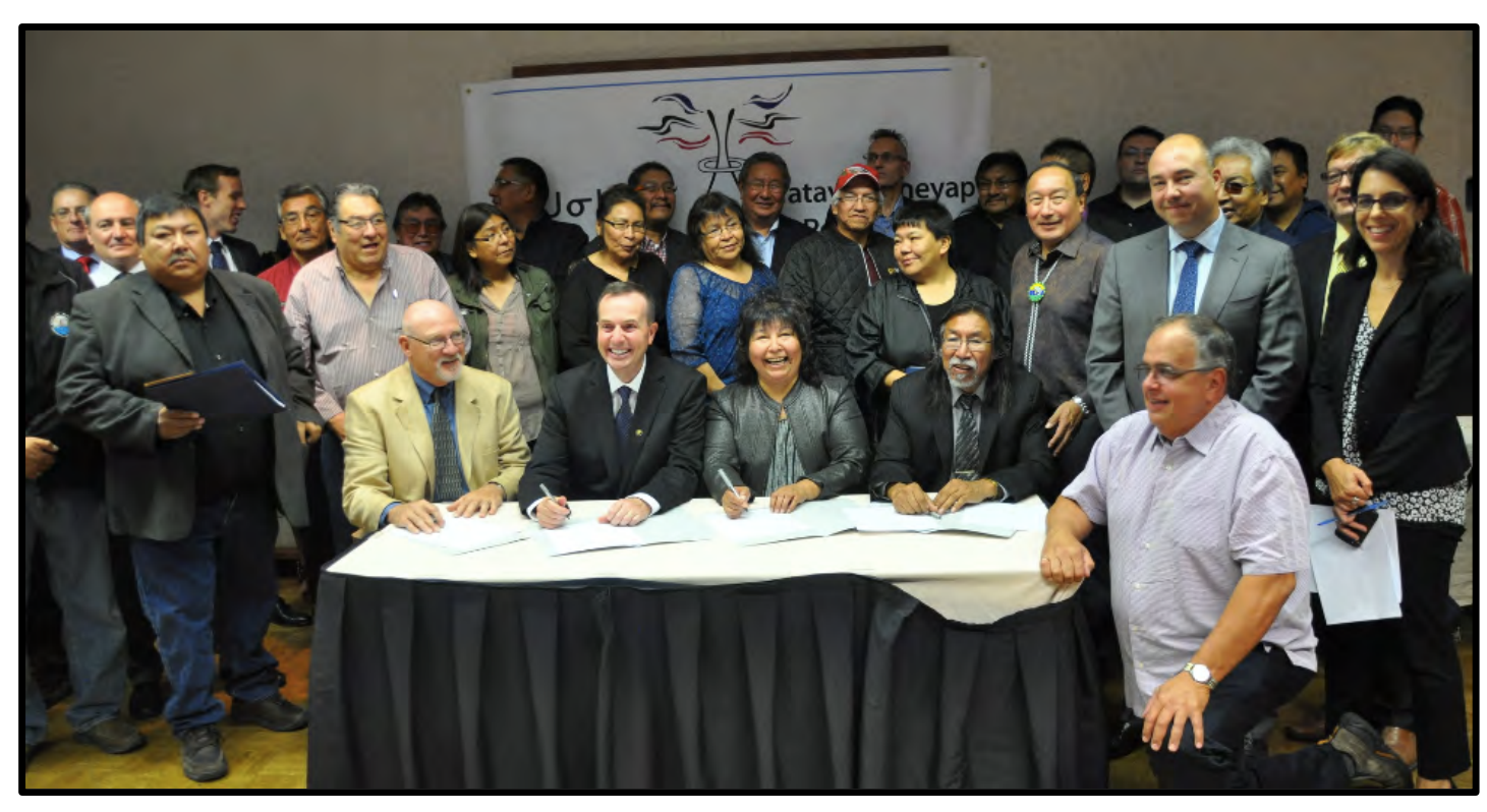
The Wataynikaneyap Power Team