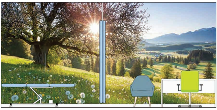
Artist impression - Feature Wall Mural

Queen Elizabeth Hospital Birmingham is the most active transplant centre in Europe with world-leading surgeons and cutting-edge equipment. It is one of only two centres in the UK that can facilitate all the major organ transplants – heart, lung, liver and kidney.