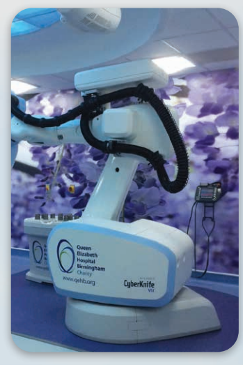
Cyberknife is a £3.5 million state-of-the-art radiotherapy machine that joined the Queen Elizabeth Hospital Birmingham's cancerfighting toolkit in 2013, which has now provided revolutionary treatment to over 2,000 patients.

During Remember a Charity week we detailed some of our projects that have been part funded thanks to gifts in wills as well as updated our offers so that it has never been easier for UHB Charity supporters to make a will. You can find lots of information below about this as well as a crossword to complete!