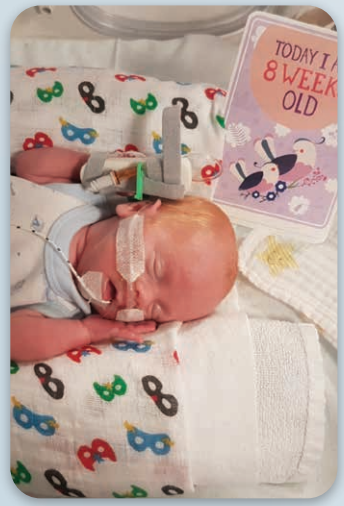
UHB Charity funded seven incubators thanks partly to gifts in wills, which gives babies born too early the best possible start in life.