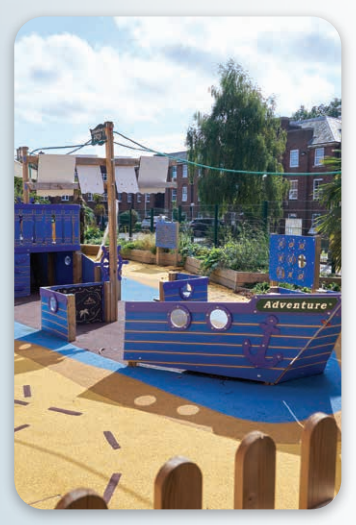
Gifts left in wills helped to fund the new Paediatric Day Surgery Unit and Children's garden and play area, complete with pirate ship, at Heartlands Hospital.