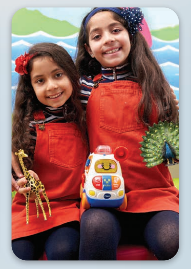
Solihull Hospital recently had its Children's Outpatients Department refurbished, transforming the dull, uninviting and intimidating surroundings to a brighter and more child-friendly place to be.