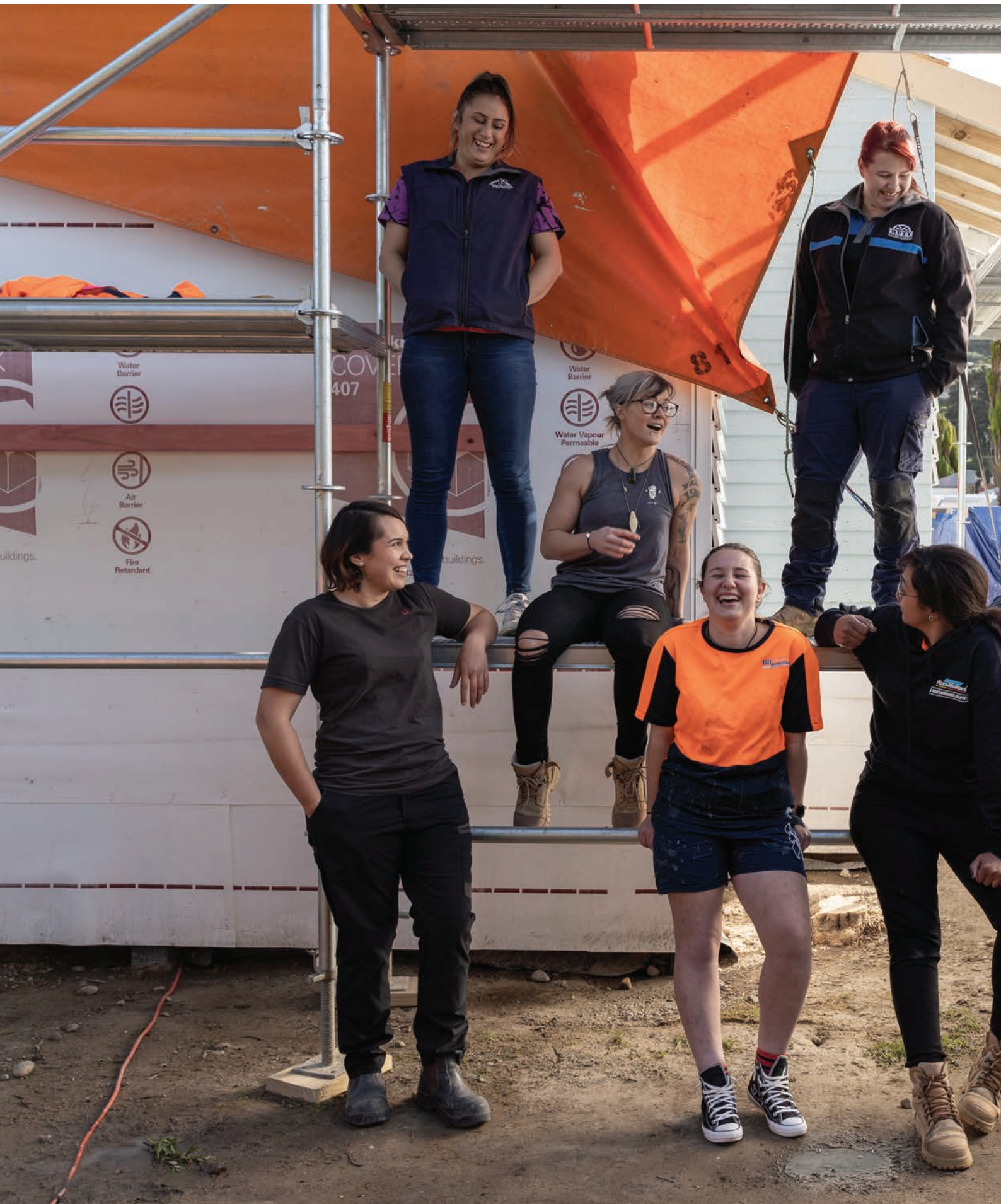
Proudly supported by Waihangā Ara Rau and Hanga-Aro-Rau Workforce Development Councils