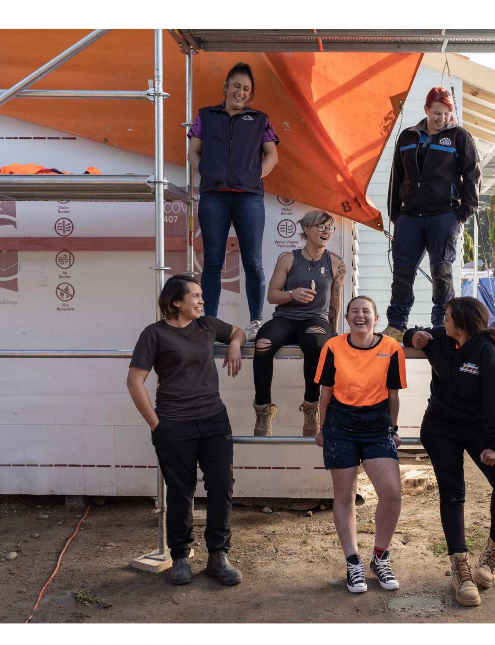
Proudly supported by Waihanga Ara Rau and Hanga-Aro-Rau Workforce Development Councils