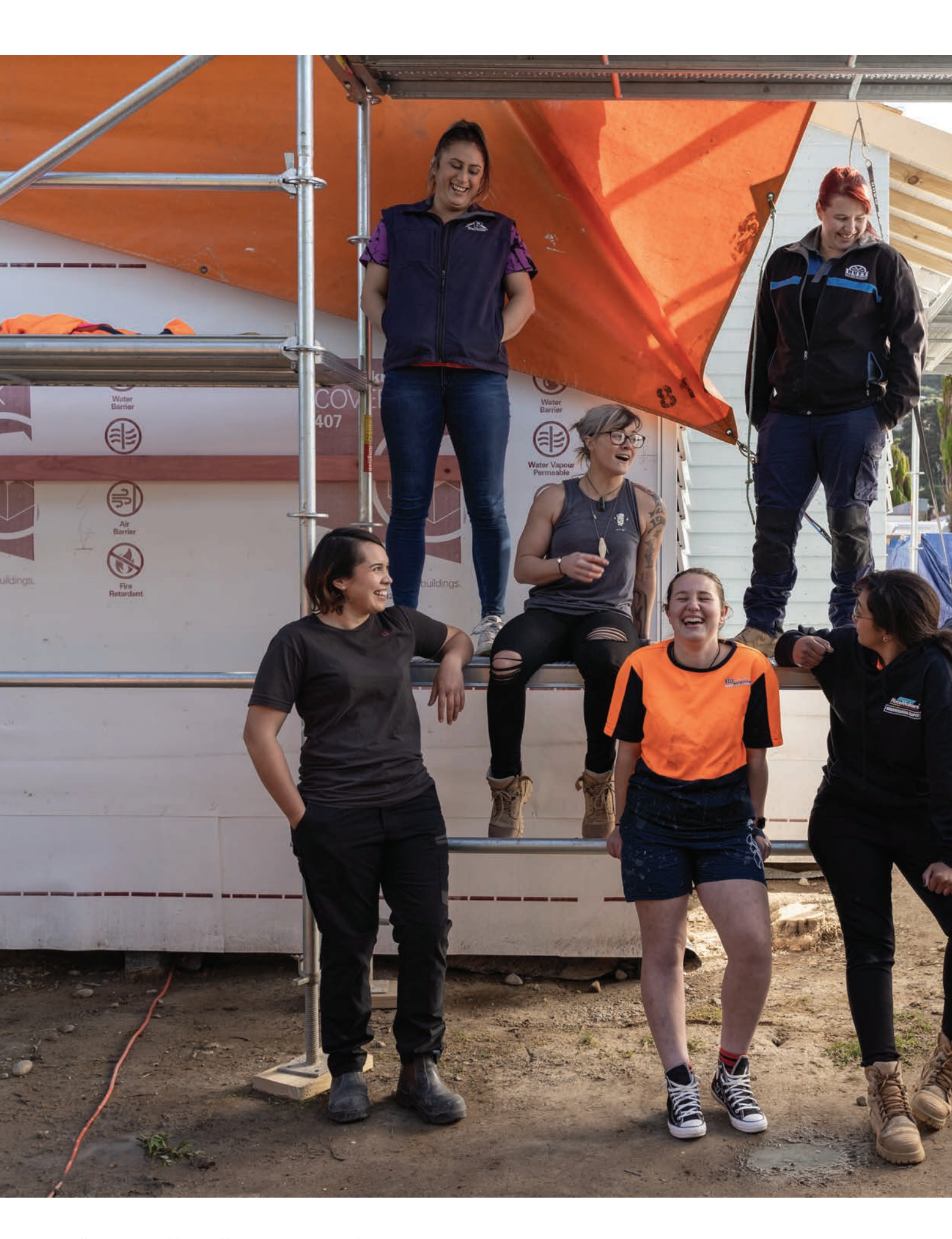
Proudly supported by Waihanga Ara Rau and Hanga-Aro-Rau Workforce Development Councils