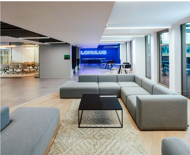
A very empty Lokulus HQ in the midst of lockdown in 2020

As businesses transform from this well-understood and structured operational model, to one that is unstructured and disconnected physically, it offers the opportunity to capitalise and tap into the power of artificial intelligence to make decisions irrespective of workforce location.