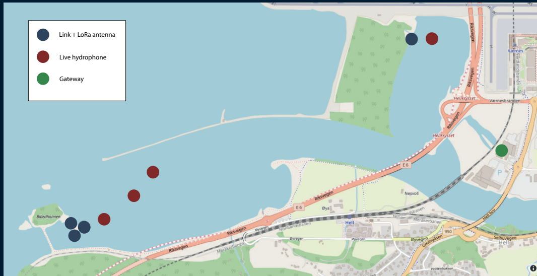
Figure 3 . The Link LoRa system setup at Hellstranda, Trondheim, Norway

The deployed Link LoRa system at Hellstranda, Norway, is a great example of an effective setup. In this particular study, salmon, trout and cod was tagged to monitor live fish data as a response to an ongoing site fill at the river estuary.