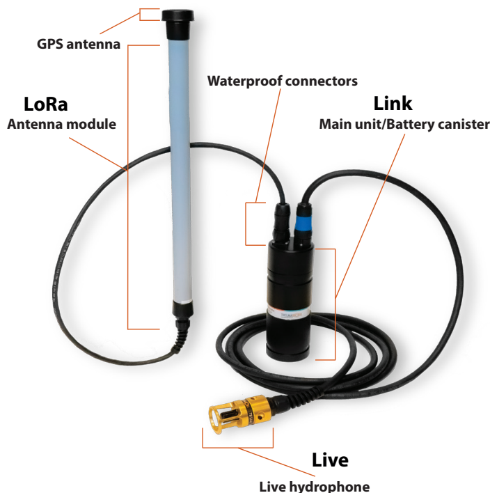
Figure 1. The different components of the Link LoRa system

Each Link LoRa sensor node consists of an antenna module with the GPS/LoRa antenna, the Link LoRa main unit with battery canister, and a Live hydrophone. Everything is connected by waterproof connectors (Figure 1). The Link LoRa main unit is delivered in two versions, for a single or two DD cell batteries. The batteries keep the nodes running up to 5 or 10 months for the single/double battery option.