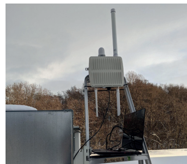
Gateway setup station

The Link LoRa sensor node can send radio signals to a gateway up to 3-5 km away. A remote, long-range network is created with the gateway to access the internet. The Link LoRa nodes run independently on their individual batteries and can then be deployed for months on remote locations like smaller buoys close to the coast or in rivers and lakes. The ultra-low power consumption of the Live hydrophone and Link LoRa system makes this possible. The built-in GPS acquires accurate timing for position calculations and can even be used for live, fine-scale 3D positioning. The GPS also tracks the position of the LoRa node itself.