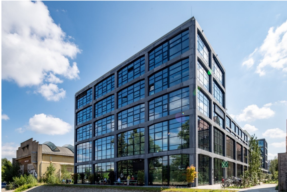
Figure 1 The building of the Munich Urban Colab in Munich

With the satellite in NPL, we aimed to test and learn how a smaller version of such a space could be established in a district with a different target group — including people with different backgrounds and people with lower educational levels (non-academic) as in the Munich city centre. Together with the mobile MakerSpace in the immediate vicinity (T3.4 The Mobile MakerSpace), the Innovation Space should offer a low-threshold opportunity to raise awareness for entrepreneurship among citizens in NPL.