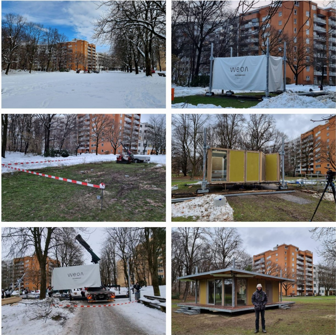
Figure 6: Installation of the NEBourhoods Pavilion in Neuperlach