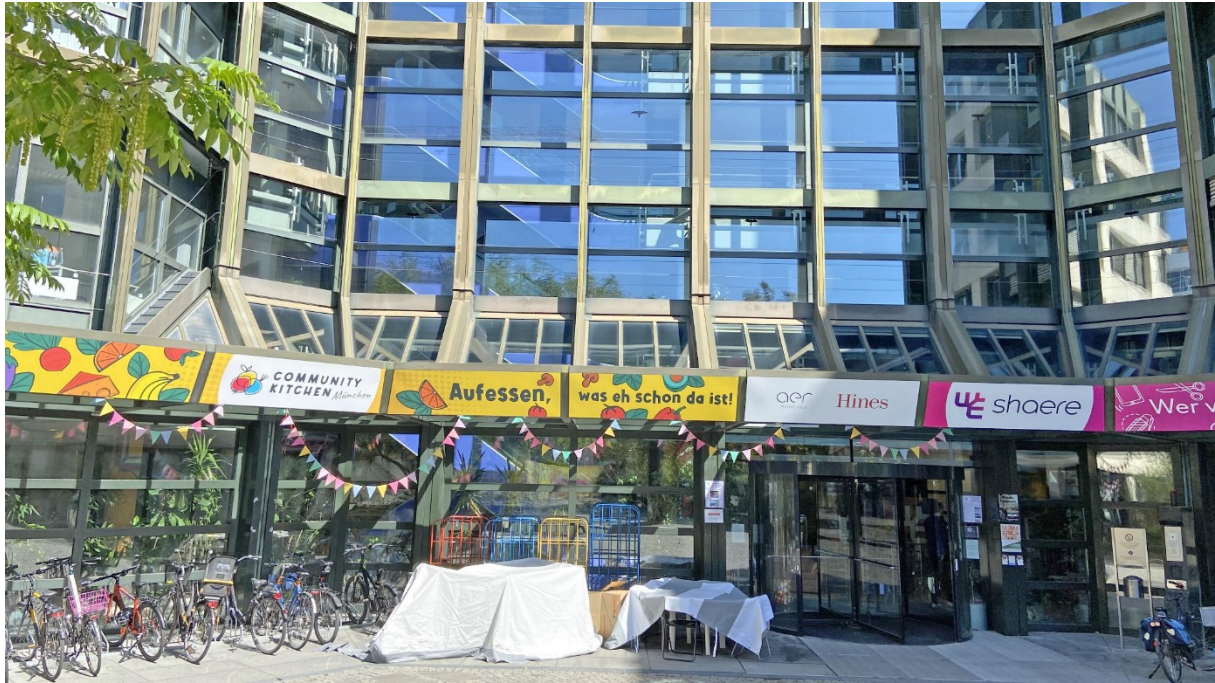
Figure 2: The entrance of the shaere building in Neuperlach

However, when the project officially launched in October 2022, there was no longer connected space available in the shaere that would have met our requirements. Especially a ground floor presence would have been needed. Secondly, we realized that the size and vast layout of the building, with its numerous daily activities, could lead to the innovation space lacking the visibility and accessibility that we envisioned.