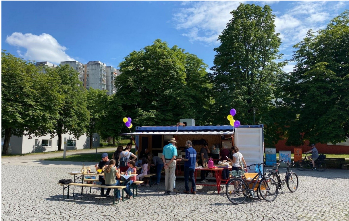
Figure 4: MakerSpace Container Workshop at the Theodor-Heuss-Platz in Neuperlach

The container was regularly open to the public, encouraging creativity and collaboration within the local community. This mobile unit belongs to the UnternehmerTUM MakerSpace GmbH, which is running two very large workshops — one at Munich Urban Colab and the other at the UTUM headquarter in Garching ( https://maker-space.de/ ). These facilities offer entrepreneurs and start-ups the tools and equipment needed to develop MVPs and prototypes into finished products. We also awarded 50 scholarships to Neuperlach residents, offering them one year of free access to these larger workshops, including two machinery courses at no cost (D3.3 MakerSpace scholarship process).