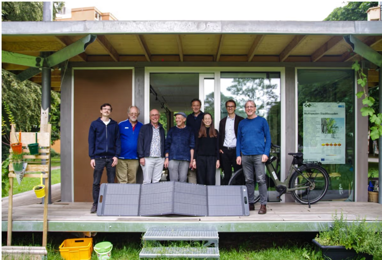
Figure 9: Energy Community at the NEBourhoods Pavilion

The pavilion served as a visible meeting point for the energy community. Events were also held there to raise public awareness of the possibilities of solar energy in a playful way. At an event in summer 2024, for example, we distributed ice cream to the residents, which we had cooled using solar energy with the help of the so-called solar bag from the NEB Action Energy Communities.