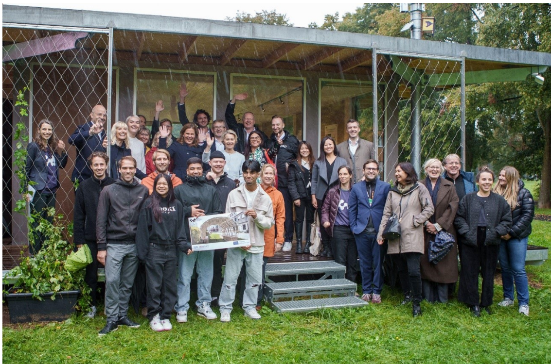
Figure 10: Visit of the President of the European Commission at the NEBourhoods Pavilion in Neuperlach