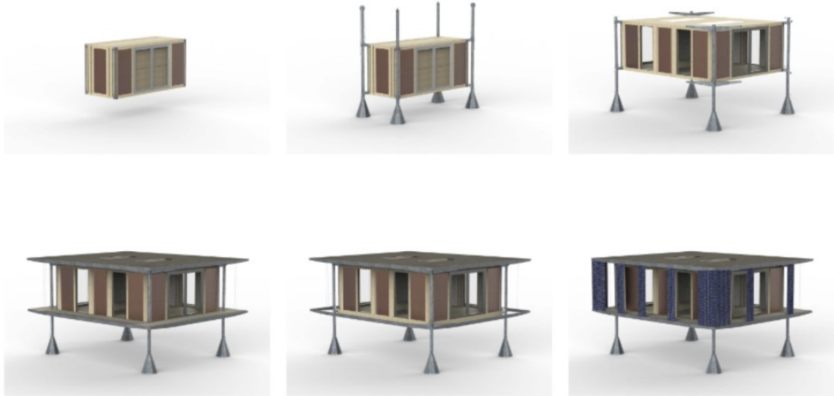
Figure 3: Design for WeOn's first prototype

ensured accessibility, and introduced a start-up presence to the neighbourhood. For these reasons, we decided to use the pavilion as our innovation space in the district of NPL.