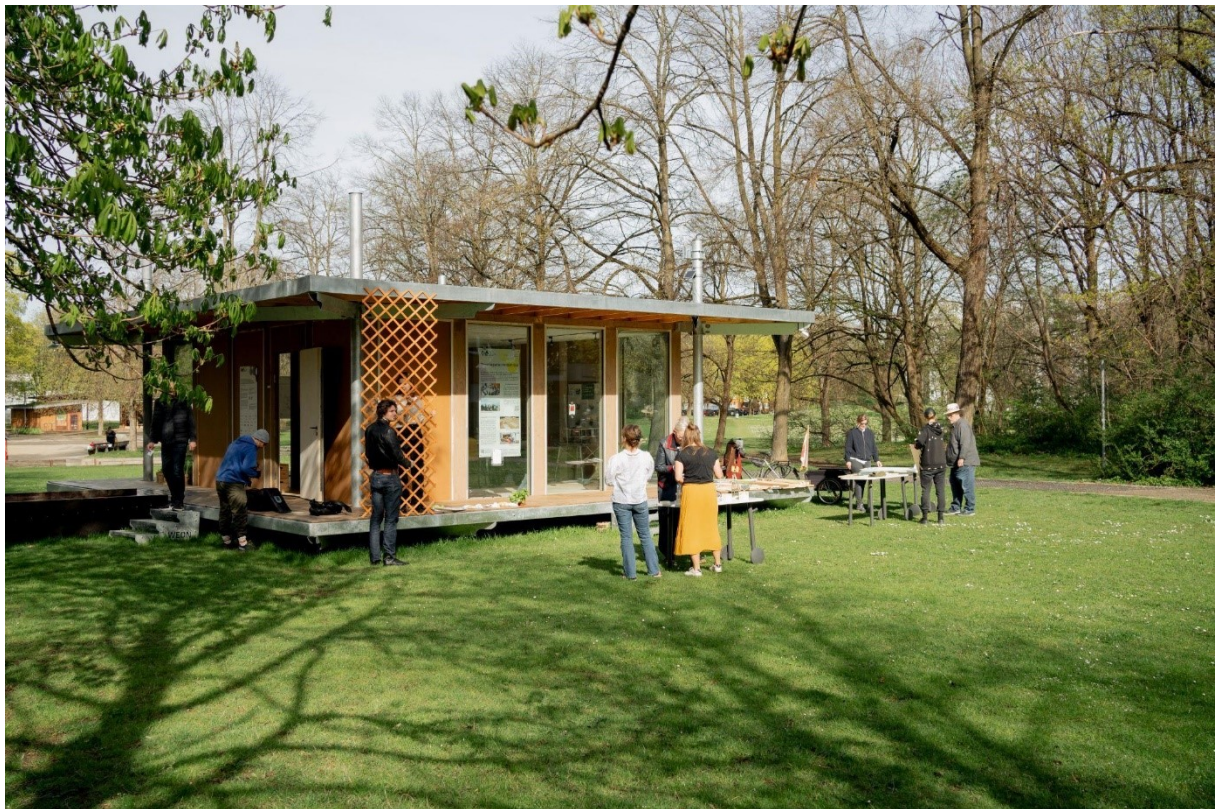
Figure 7: NEBourhoods Pavilion in Neuperlach in Summer 2024

After its opening in December 2023, we rented the Pavilion from WeOn for the duration of NEBourhoods (see Figure 7). We took a liability insurance to cover any potential damage to the pavilion. To improve accessibility, a ramp was designed and installed retroactively. Trellises were installed to allow climbing plants to grow on the veranda.