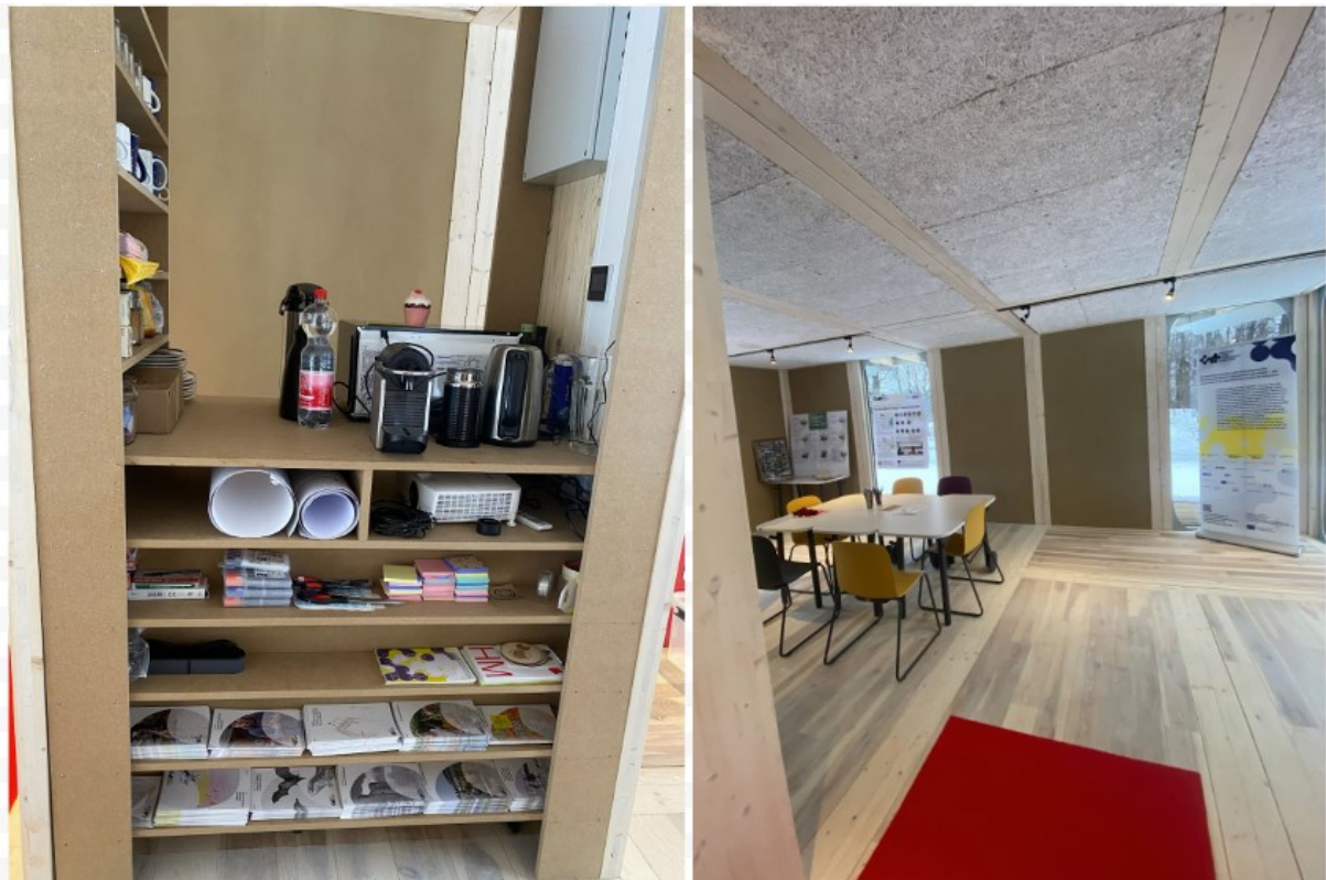
Figure 8: Furnished NEBourhoods Pavilion

The kitchen was equipped with a kettle, a microwave, a refrigerator, and a mini dishwasher. An association located nearby allowed us to use their premises to get water for the dishwasher and to use their restroom for a small monthly fee (the association ZAK "Zusammen Aktiv in Neuperlach" e.V.).