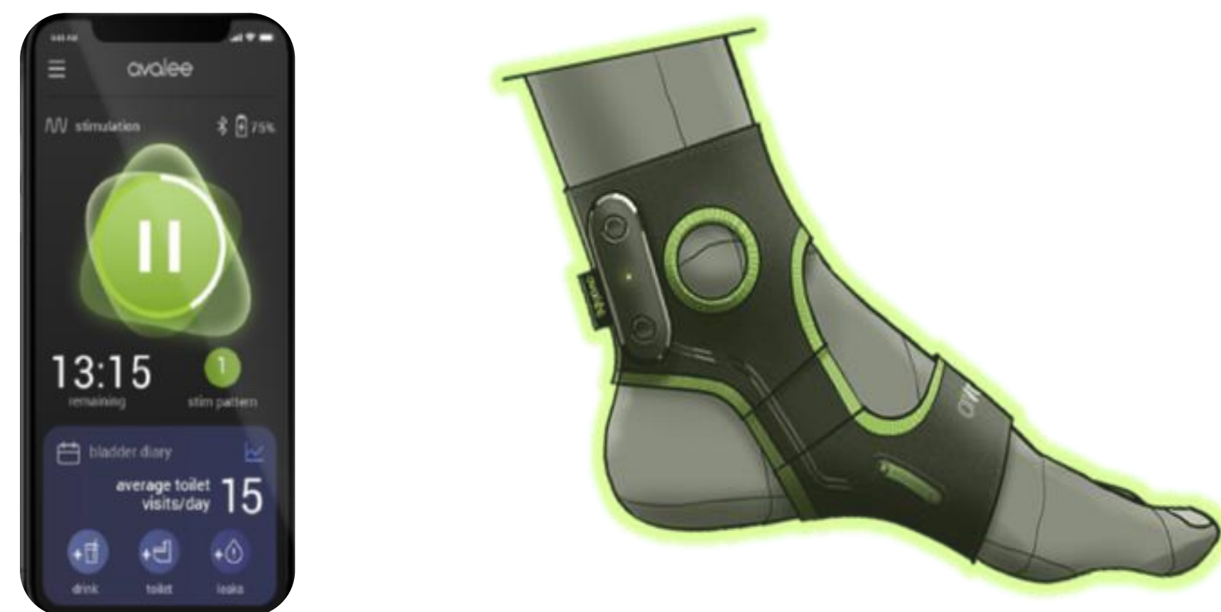
Figure 1. The surgery-free, closed-loop wearable neuromodulation system with objective confirmation of nerve activation. System includes mobile application, garment and stimulator.

This study evaluated tolerability, usability, and patient satisfaction of a wearable non-invasive neuromodulation system for treating OAB that incorporates EMG as a control signal that objectively confirms nerve stimulation.