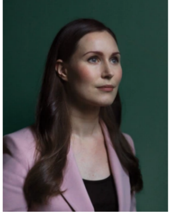
Marin at Kesäranta, the official residence of the Finnish Prime Minister, in Helsinki on Dec. 20. 20 Dec. 2019. Time, TIME USA, time.com/collection/davos-2020/5764097/sanna-marin-finland-equality/. Accessed 11 Nov. 2020