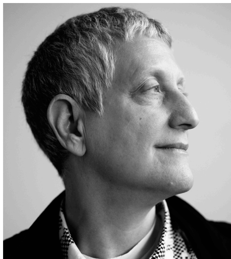
RONI HORN Wits' End Mash 2 October – 27 November 2021