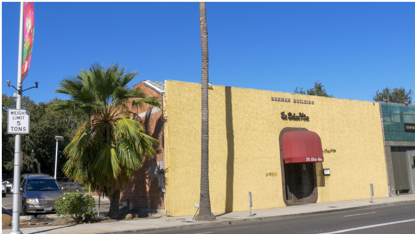
Ed Ruscha (1937- ) L.A. Restaurants 2019 4K mp4 video from Lumix GH4/GH5 cameras at 60fps 22 min. 16 sec.