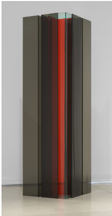
Robert Irwin Trips 2021 Acrylic 299.7 × 84.5 × 84.5 cm Unique