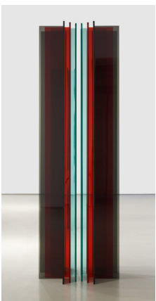
Robert Irwin Four Corners 2021 Acrylic 299.7 × 94 × 94 cm Unique