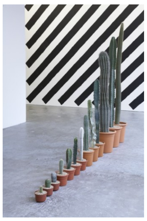
Martin Creed, Work No. 9601, 2000.

Well, that's exactly it. It's completely straightforward, but still confusing. My take on it was that the work was just an addition to the totality of the stuff that makes up the