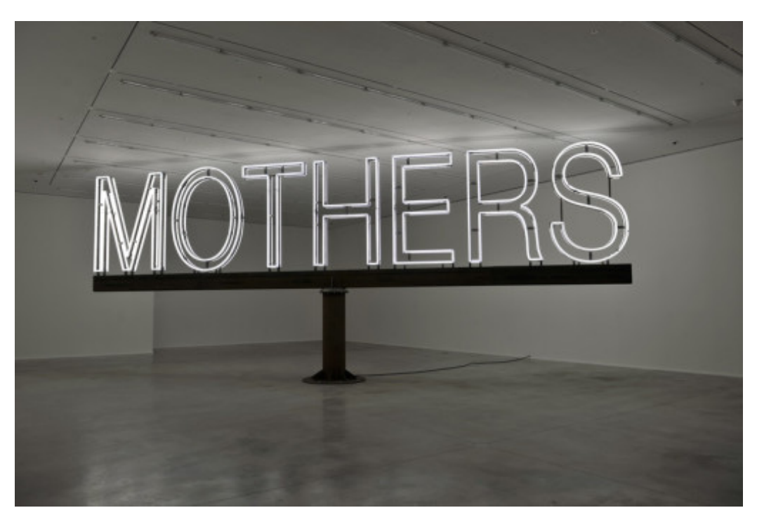
Martin Creed, Work No. 1092, 2011. White Neon, steel.