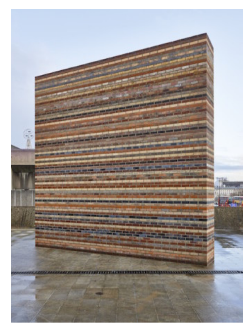
MartinCreed, Work No. 1812, 2014.

- Well, I make a lot of notes in notebooks, or record voice notes. For a painting like the one we just made for the show here, the planning will be verbal or written. And from that point on, taking it into the world involves bringing in different materials and working with other people. It also depends on whether there's an opportunity