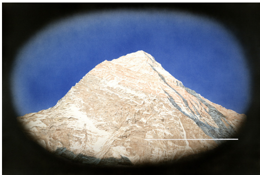
PAINTED MOUNTAIN: Ed Ruscha continues his series of painted mountains. Here is his "Spied Upon Scene - One Liner".