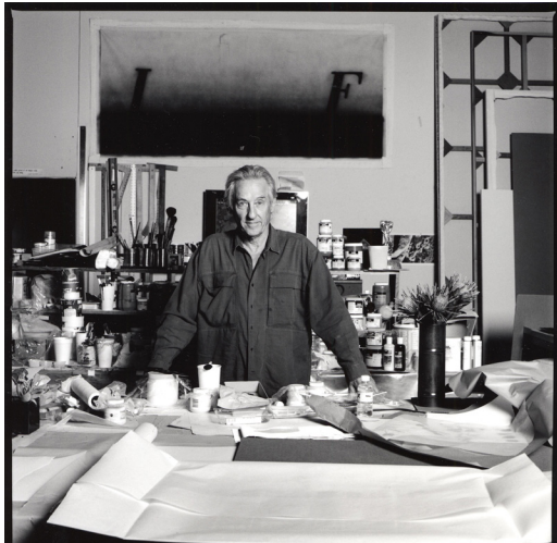
Ed Ruscha American artist born in 1937

Ed Ruscha (79) is one of the world's most famous artists alive today. Set to unveil a new exhibition in Oslo, the artist himself compares his paintings to a traditional Southern dish.