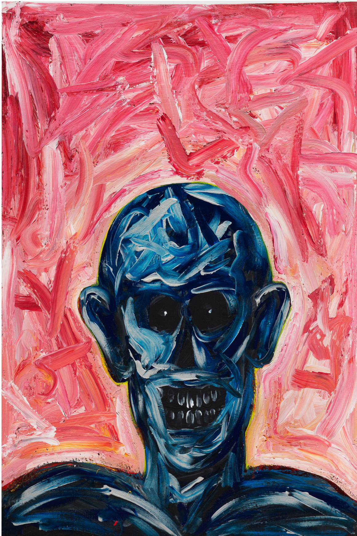
Lucas Samaras (1936- ) Untitled December 28, 1984 Acrylic on canvas 36 × 24 in./ 91.4 × 61 cm Framed: 38 1/8 × 26 1/8 × 1 5/8 in./ 96.8 × 66 × 2.5 cm