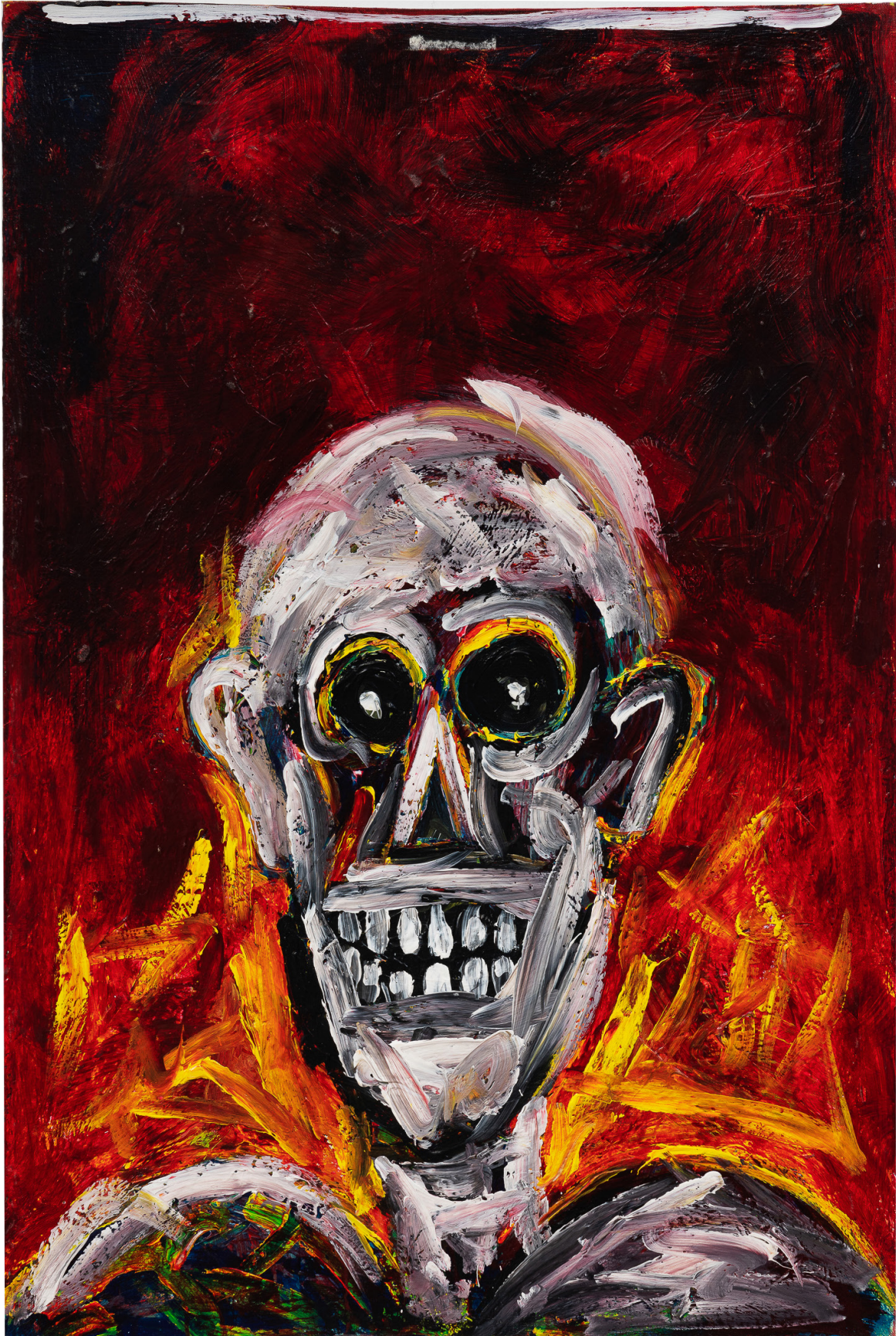
Lucas Samaras (1936- ) The Political Artist January 7, 1985 Acrylic on canvas 36 × 24 in./ 91.4 × 61 cm Framed: 38 1/8 × 26 1/8 × 1 5/8 in./ 96.8 × 66 × 2.5 cm