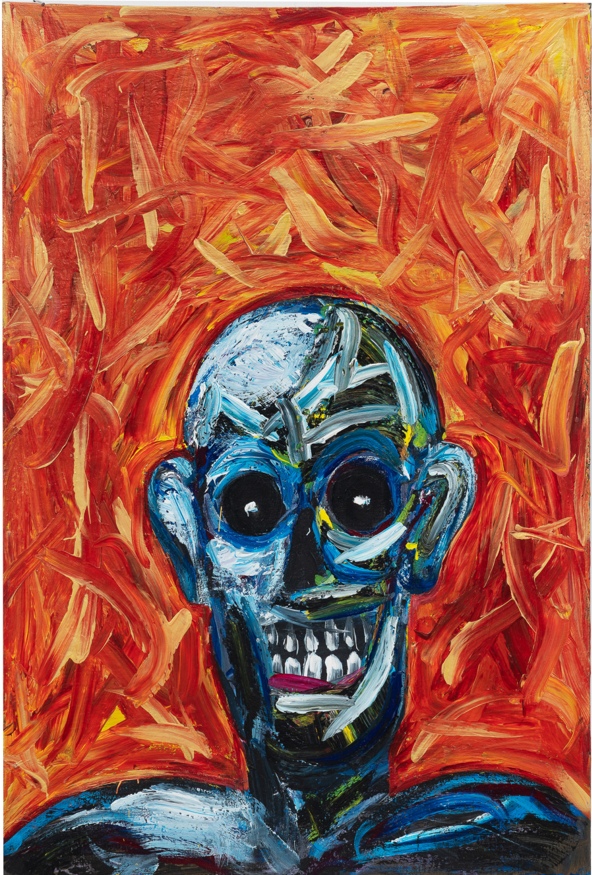
Lucas Samaras (1936- ) Untitled January 6, 1985 Acrylic on canvas 36 × 24 in./ 91.4 × 61 cm Framed: 38 1/8 × 26 1/8 × 1 5/8 in./ 96.8 × 66 × 2.5 cm