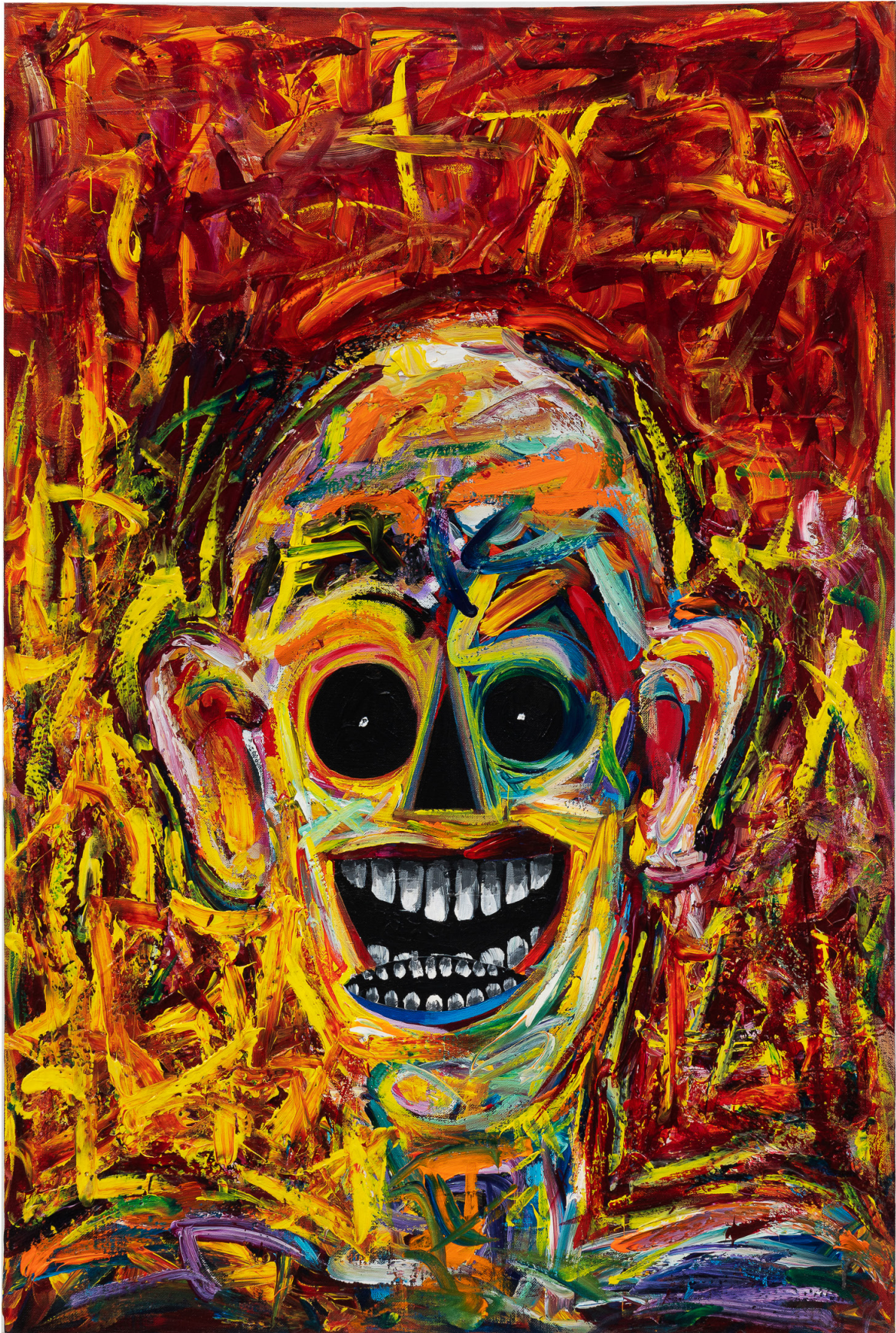
Lucas Samaras (1936- ) The Collector March 19, 1985 Acrylic on canvas 36 × 24 in./ 91.4 × 61 cm Framed: 38 1/8 × 26 1/8 × 1 5/8 in./ 96.8 × 66 × 2.5 cm