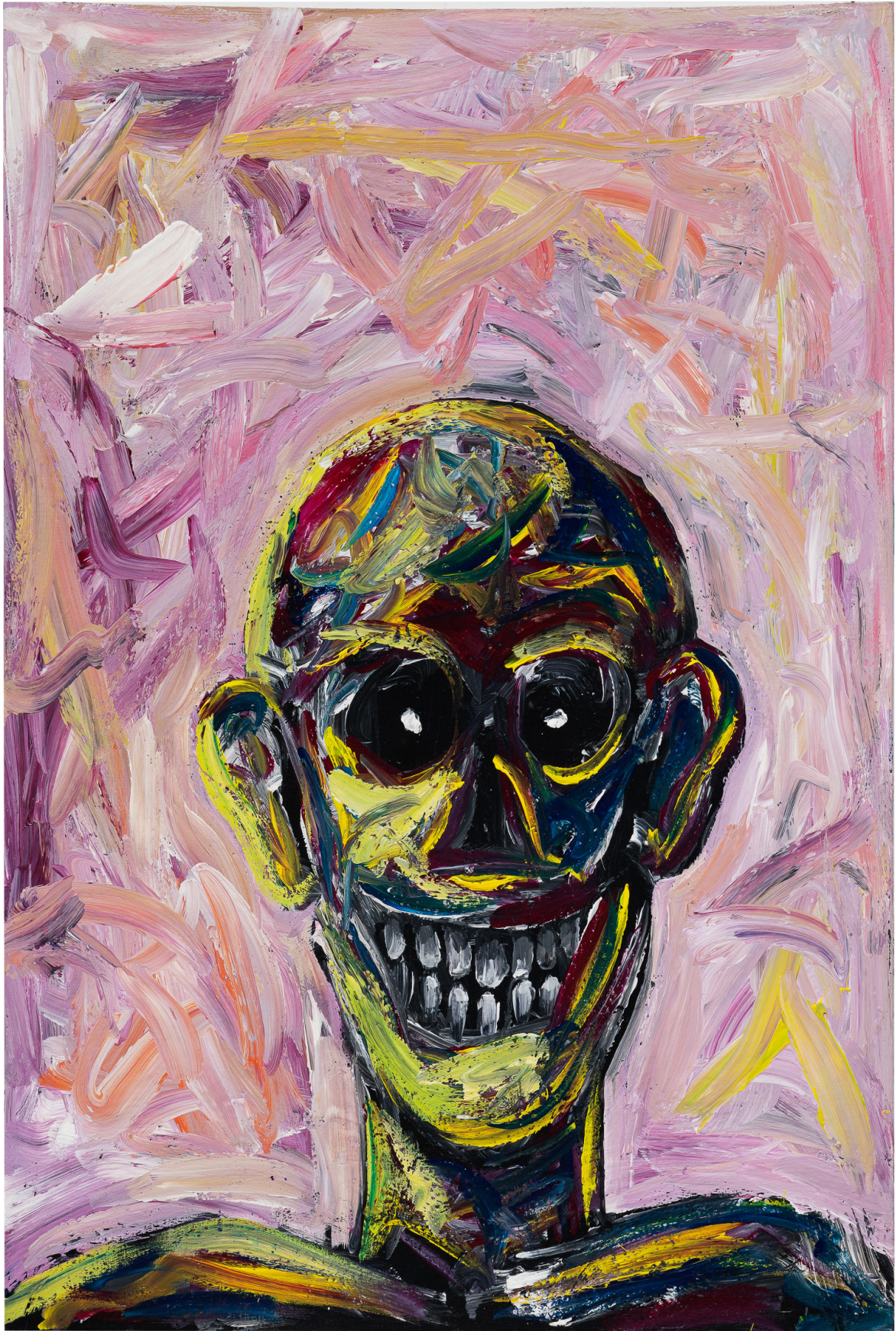
Lucas Samaras (1936- ) Untitled December 28, 1984 Acrylic on canvas 36 × 24 in./ 91.4 × 61 cm Framed: 38 1/8 × 26 1/8 × 1 5/8 in./ 96.8 × 66 × 2.5 cm