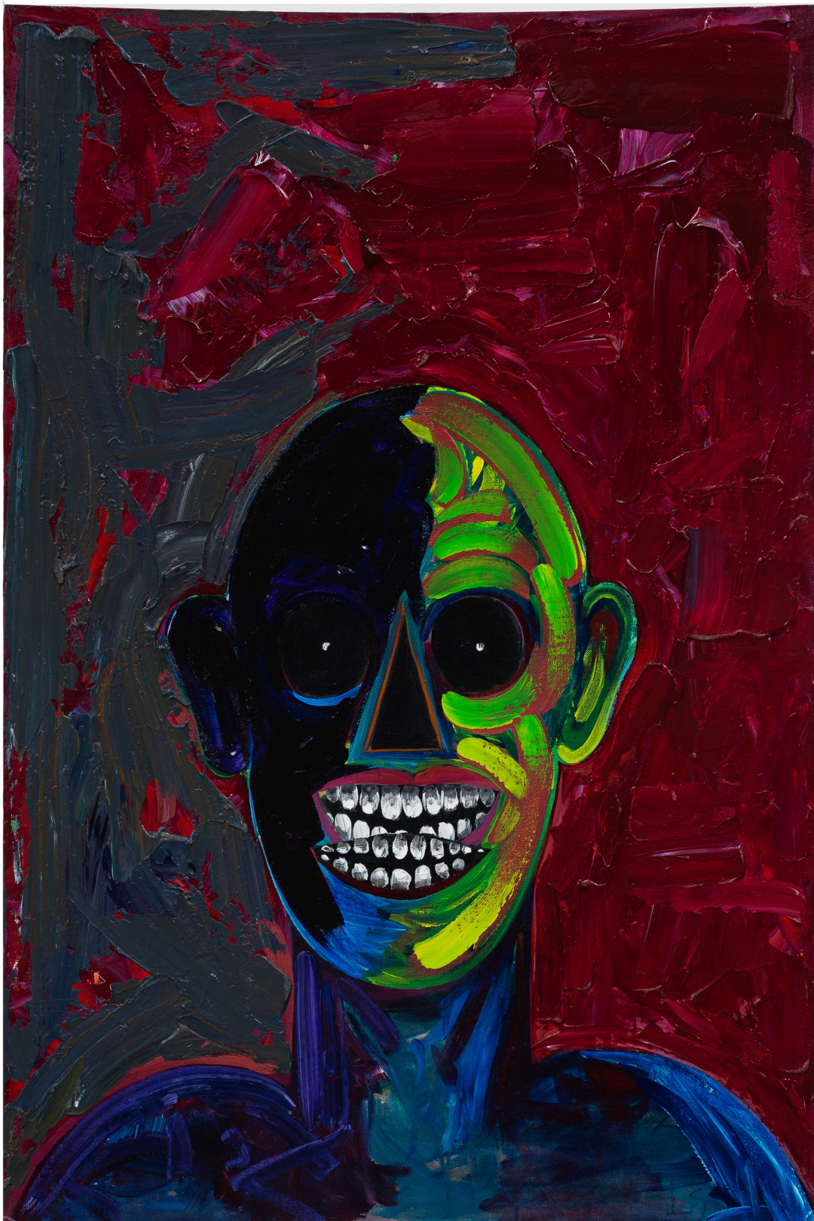
Lucas Samaras (1936- ) Untitled May 21, 1985 Acrylic on canvas 36 × 24 in./ 91.4 × 61 cm Framed: 38 1/8 × 26 1/8 × 1 5/8 in./ 96.8 × 66 × 2.5 cm