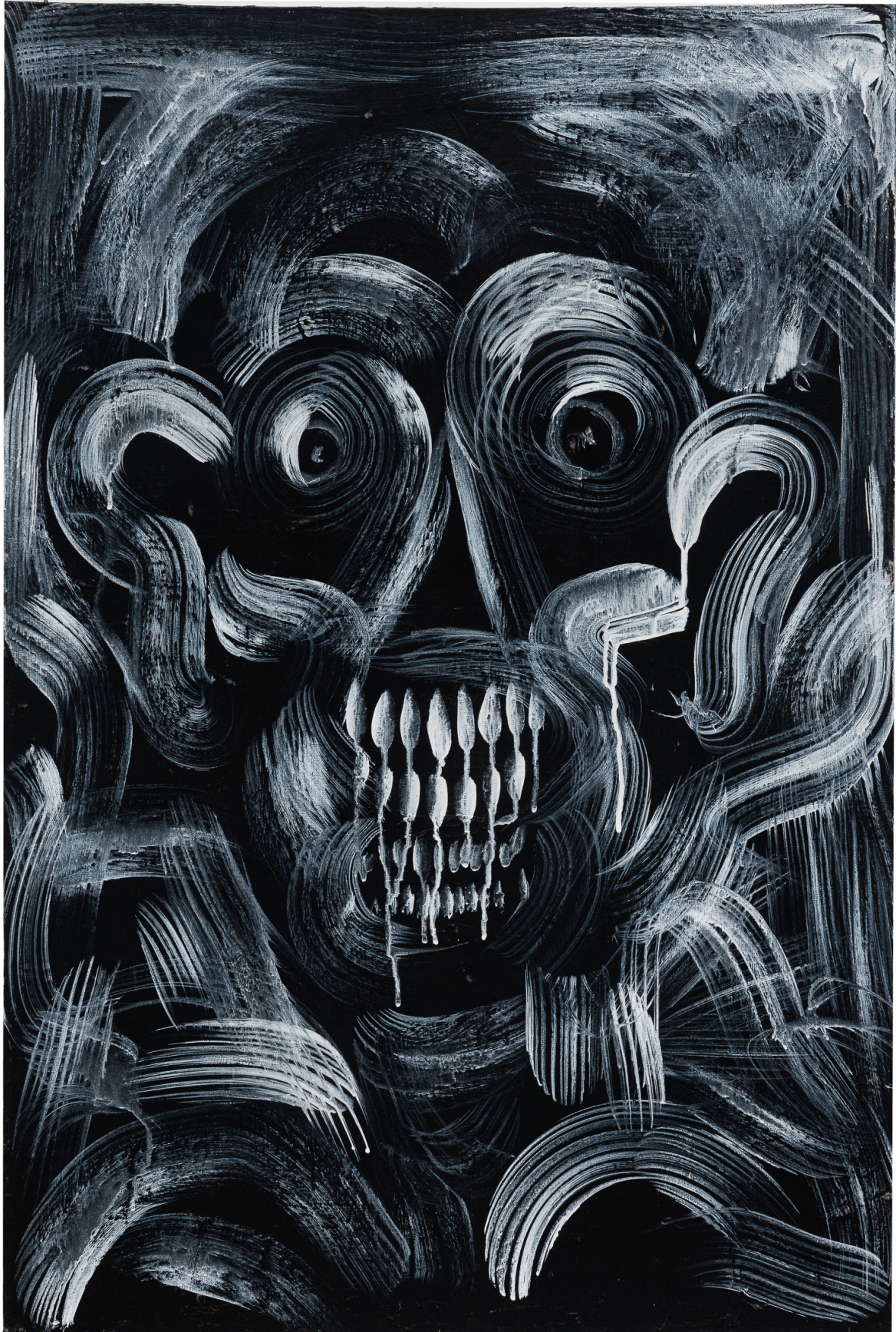
Lucas Samaras (1936- ) Untitled June 27, 1985 Acrylic on canvas 36 x 24 in./ 91.4 x 61 cm Framed: 38 1/8 x 26 1/8 x 1 5/8 in./ 96.8 x 66 x 2.5 cm