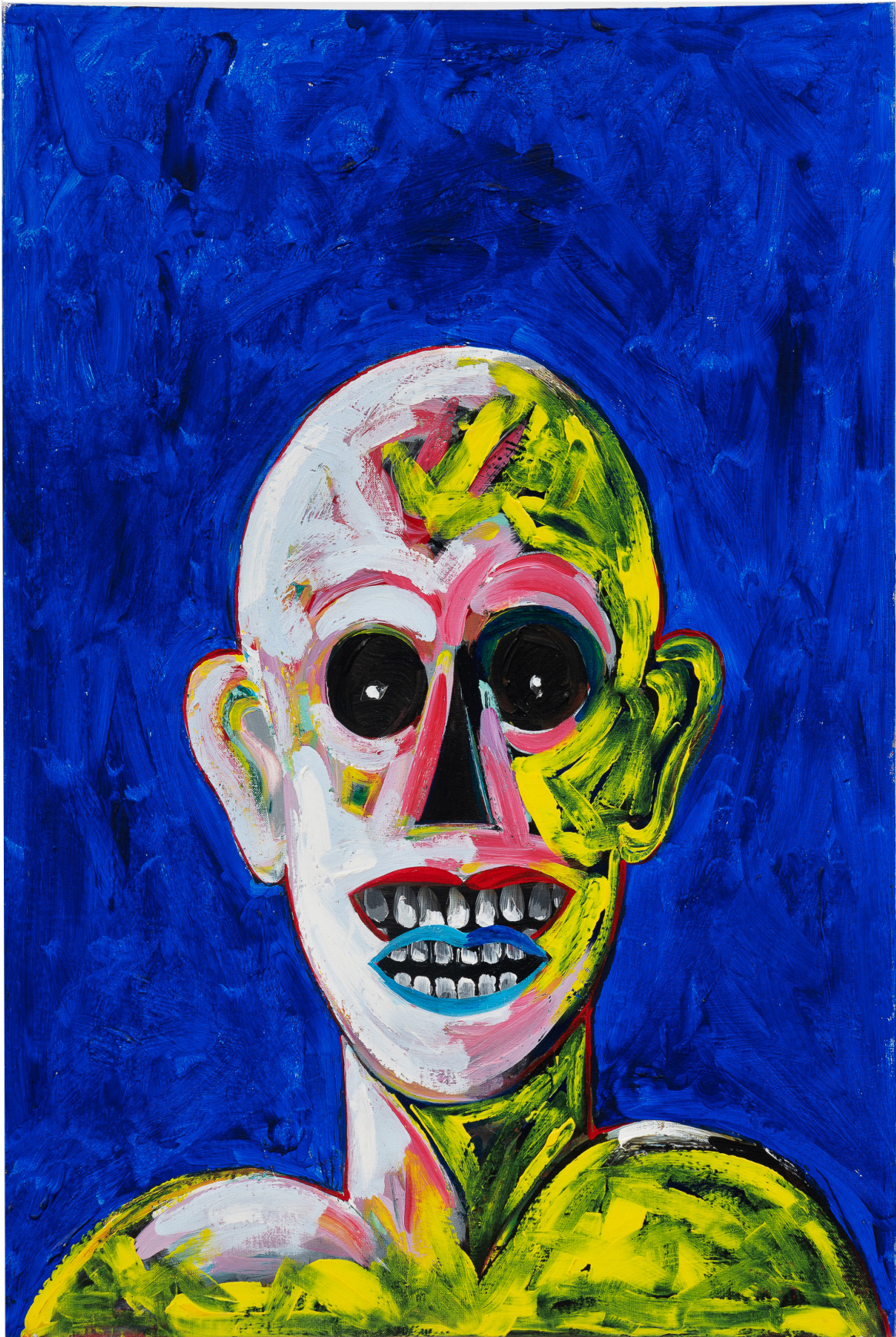
Lucas Samaras (1936- ) The Collector January 19, 1985 Acrylic on canvas 36 × 24 in./ 91.4 × 61 cm Framed: 38 1/8 × 26 1/8 × 1 5/8 in./ 96.8 × 66 × 2.5 cm