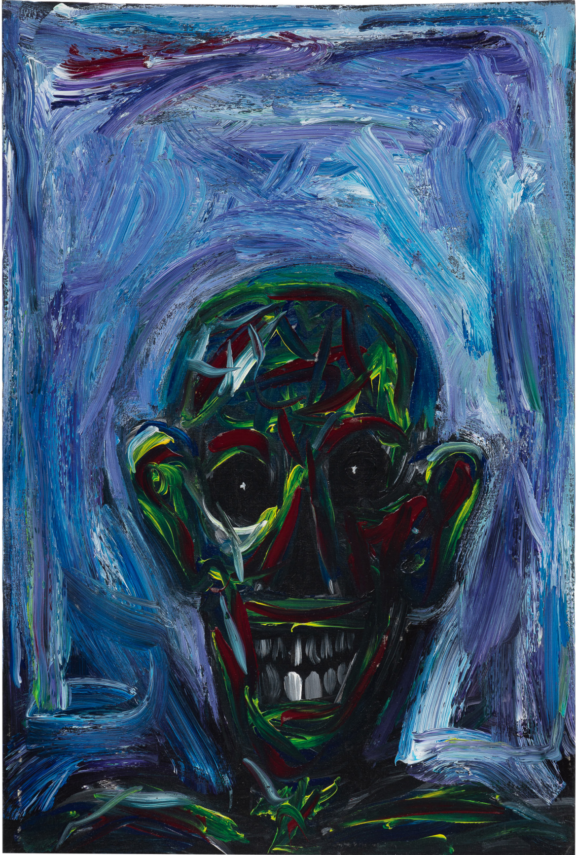
Lucas Samaras (1936- ) Untitled December 27, 1984 Acrylic on canvas 36 × 24 in./ 91.4 × 61 cm Framed: 38 1/8 × 26 1/8 × 1 5/8 in./ 96.8 × 66 × 2.5 cm