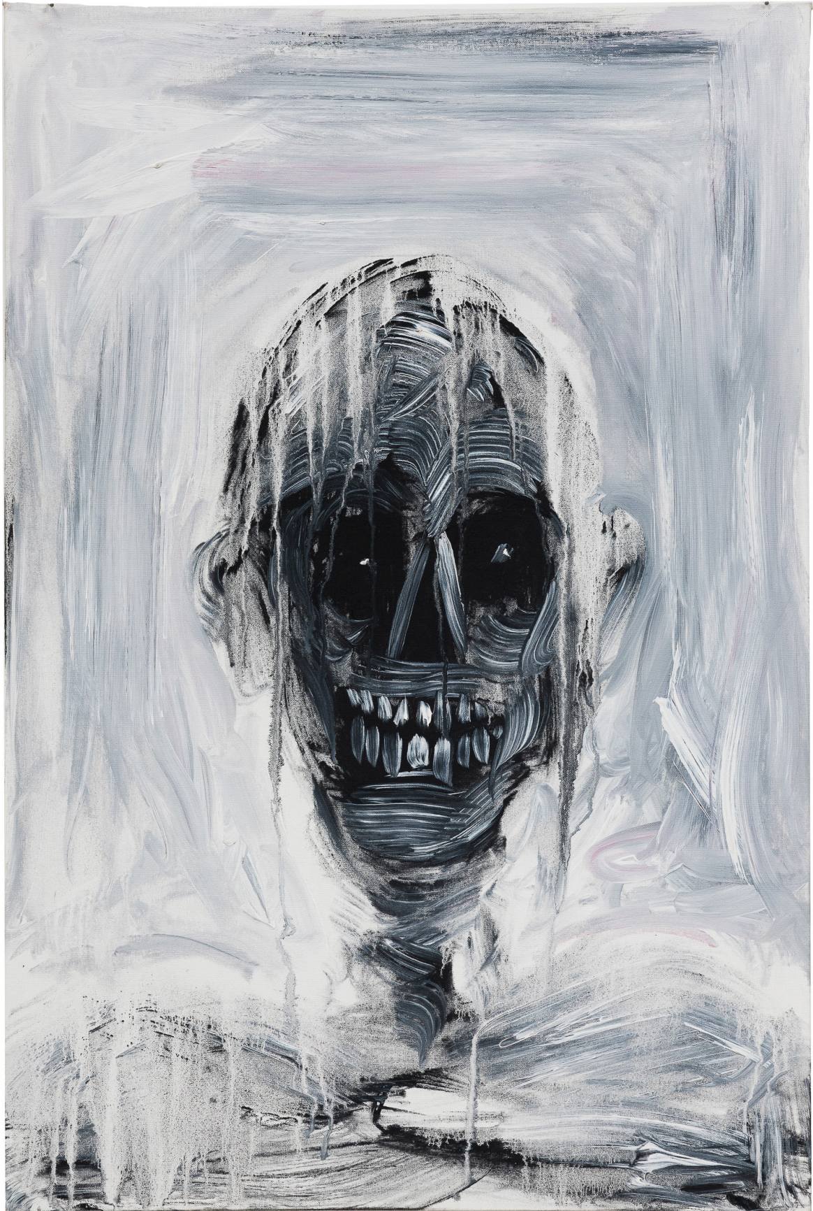
Lucas Samaras (1936- ) The Art Critic December 31, 1984 Acrylic on canvas 36 × 24 in./ 91.4 × 61 cm Framed: 38 1/8 × 26 1/8 × 1 5/8 in./ 96.8 × 66 × 2.5 cm