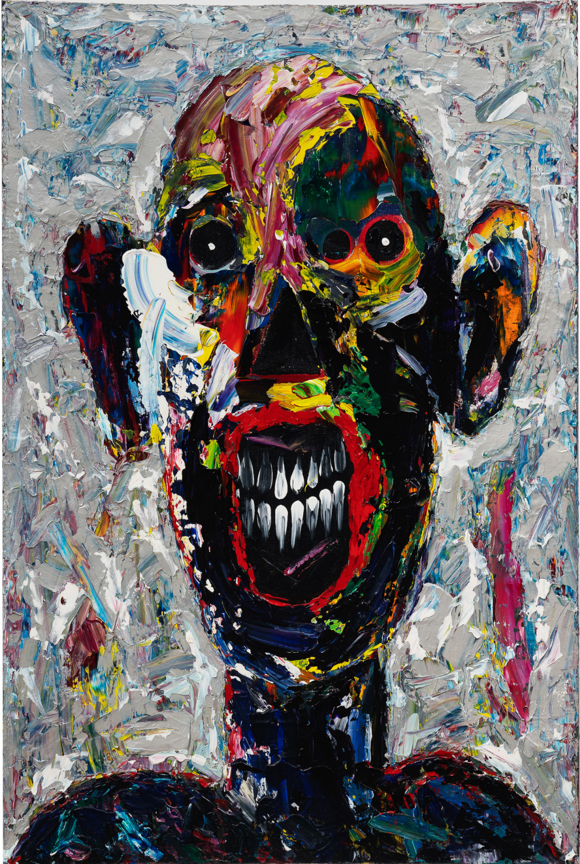
Lucas Samaras (1936- ) Untitled June 10, 1985 Acrylic on canvas 36 × 24 in./ 91.4 × 61 cm Framed: 38 1/8 × 26 1/8 × 1 5/8 in./ 96.8 × 66 × 2.5 cm