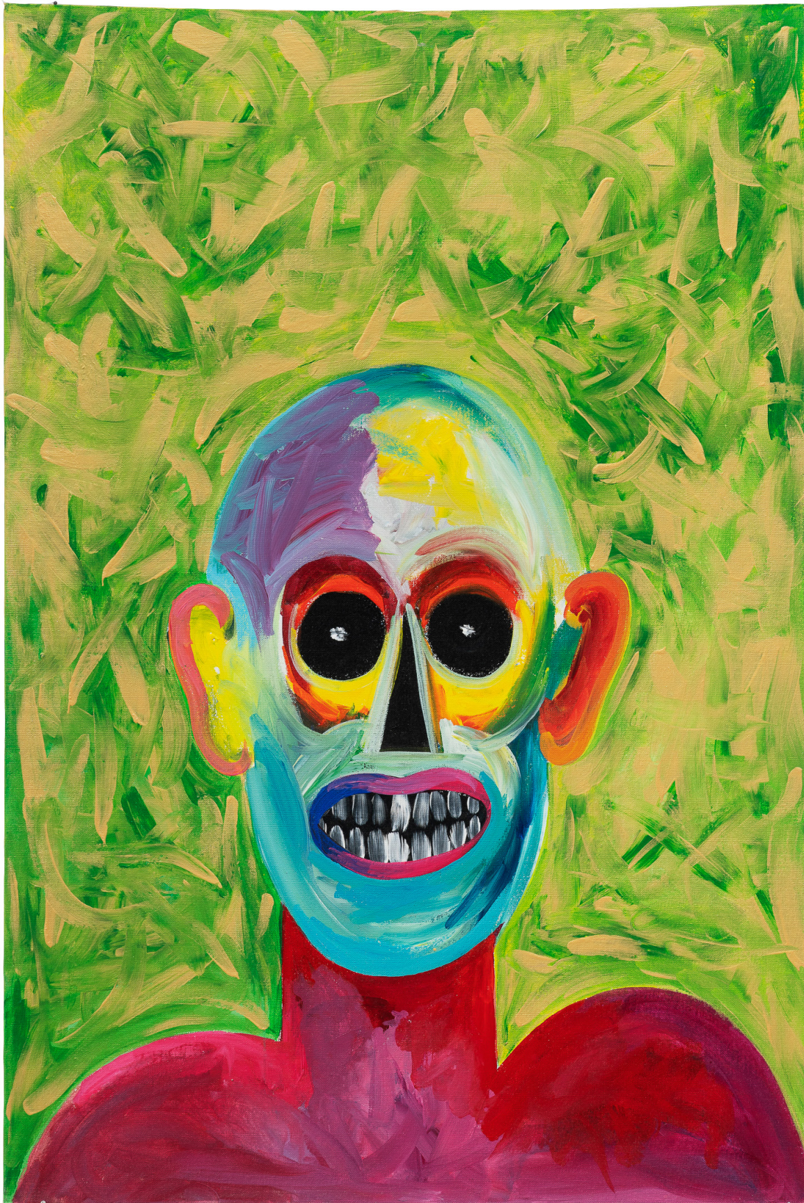
Lucas Samaras (1936- ) Untitled January 18, 1985 Acrylic on canvas 36 × 24 in./ 91.4 × 61 cm Framed: 38 1/8 × 26 1/8 × 1 5/8 in./ 96.8 × 66 × 2.5 cm