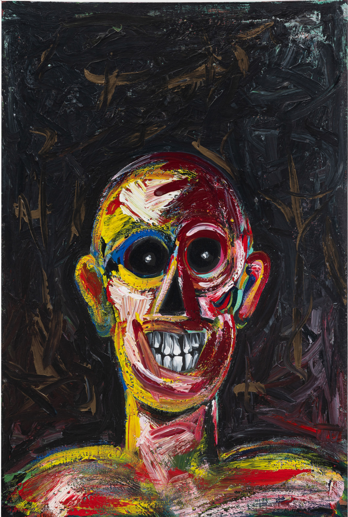
Lucas Samaras (1936- ) Untitled December 31, 1984 Acrylic on canvas 36 × 24 in./ 91.4 × 61 cm Framed: 38 1/8 × 26 1/8 × 1 5/8 in./ 96.8 × 66 × 2.5 cm