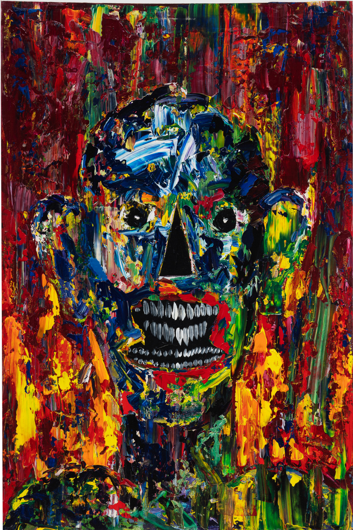
Lucas Samaras (1936- ) Untitled June 12, 1985 Acrylic on canvas 36 × 24 in./ 91.4 × 61 cm Framed: 38 1/8 × 26 1/8 × 1 5/8 in./ 96.8 × 66 × 2.5 cm