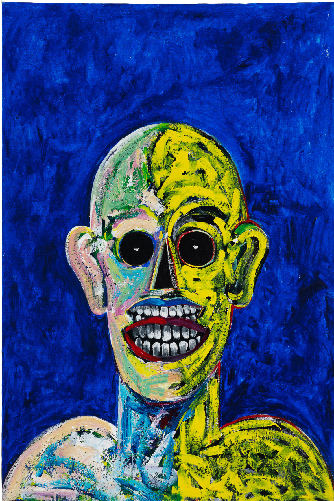
Lucas Samaras (1936- ) The Collector January 16, 1985 Acrylic on canvas 36 × 24 in./ 91.4 × 61 cm Framed: 38 1/8 × 26 1/8 × 1 5/8 in./ 96.8 × 66 × 2.5 cm