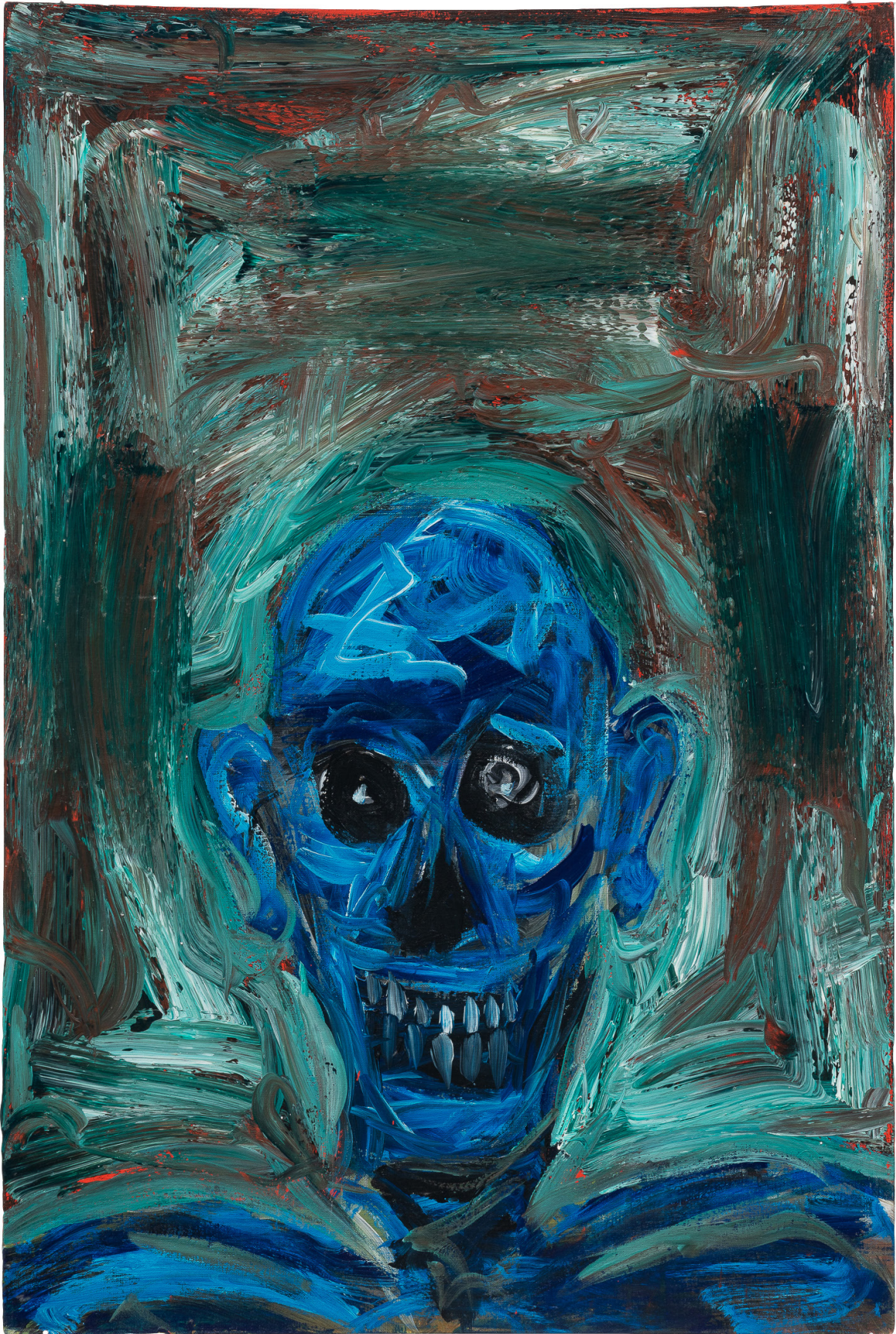
Lucas Samaras (1936- ) Untitled December 26, 1984 Acrylic on canvas 36 × 24 in./ 91.4 × 61 cm Framed: 38 1/8 × 26 1/8 × 1 5/8 in./ 96.8 × 66 × 2.5 cm