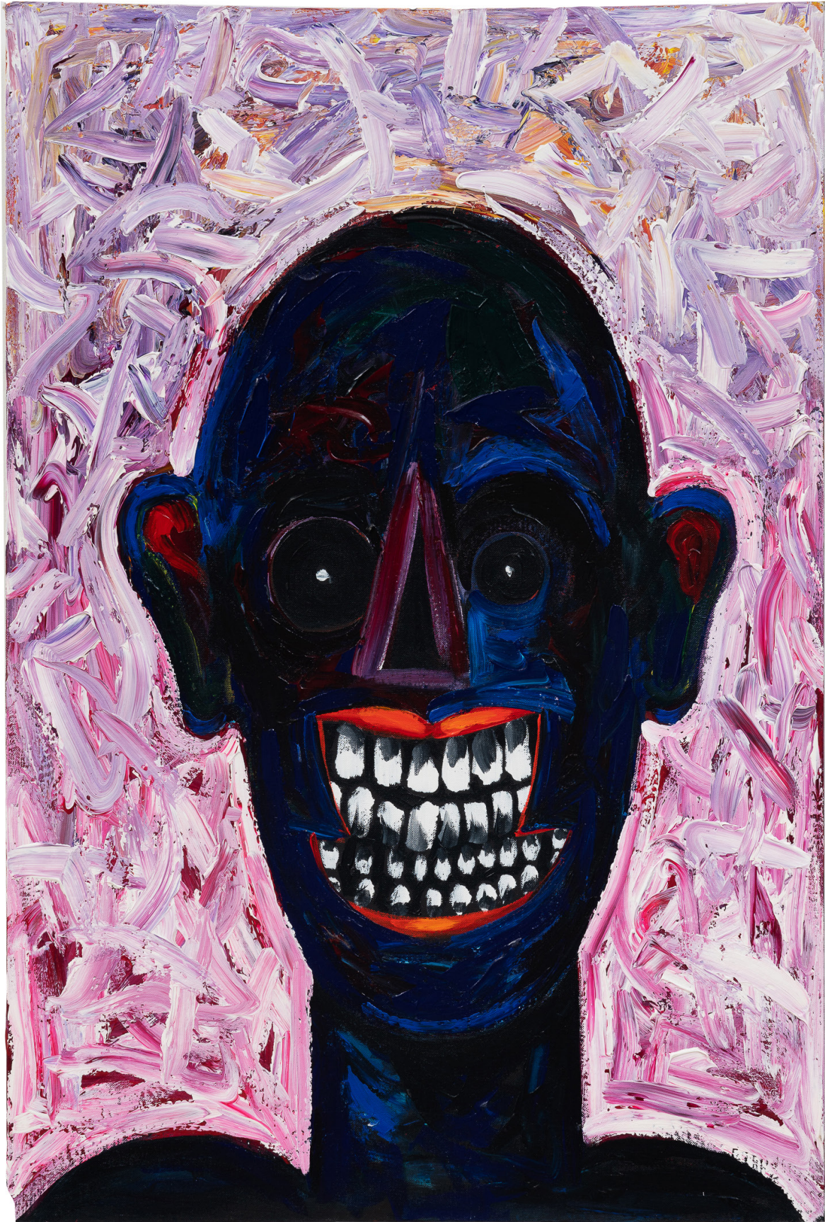
Lucas Samaras (1936- ) Untitled March 30, 1985 Acrylic on canvas 36 × 24 in./ 91.4 × 61 cm Framed: 38 1/8 × 26 1/8 × 1 5/8 in./ 96.8 × 66 × 2.5 cm