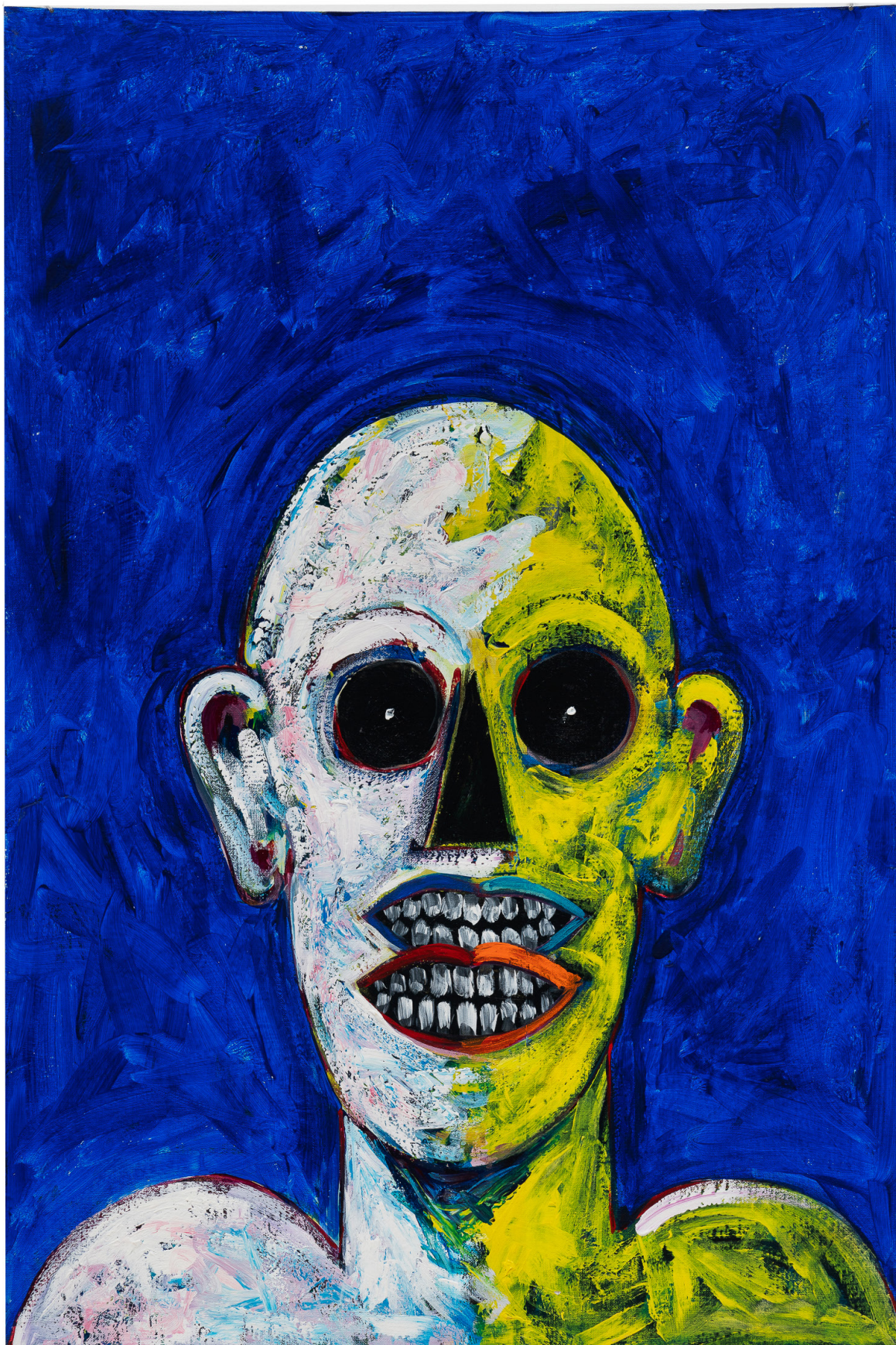
Lucas Samaras (1936- ) The Collector January 18, 1985 Acrylic on canvas 36 × 24 in./ 91.4 × 61 cm Framed: 38 1/8 × 26 1/8 × 1 5/8 in./ 96.8 × 66 × 2.5 cm