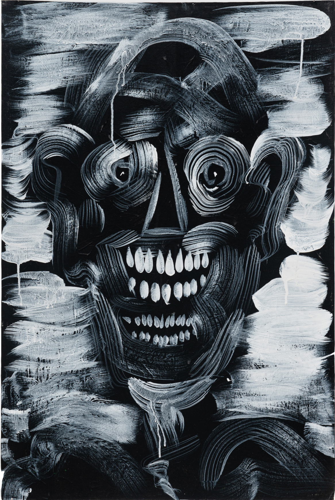
Lucas Samaras (1936- ) Untitled June 27, 1985 Acrylic on canvas 36 × 24 in./ 91.4 × 61 cm Framed: 38 1/8 × 26 1/8 × 1 5/8 in./ 96.8 × 66 × 2.5 cm