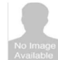
Tim Miles Day 6