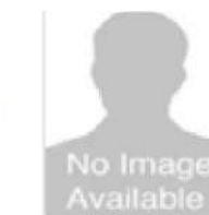
Josh Maceno Day 8