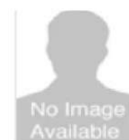
Allen Potts Day 5