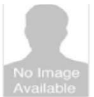
Megan Drummond Day 12