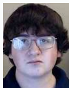
Clinton Ball Hoagie Line MFS 2nd Shift